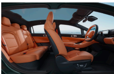
Honey Orange (PU)