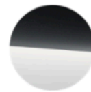
White body + Black roof