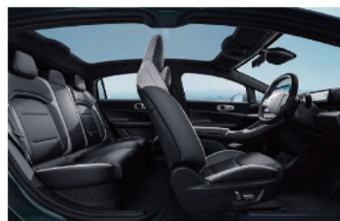
Silk Black (PU)