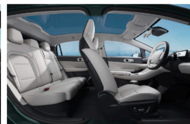
Luna Grey (PU)