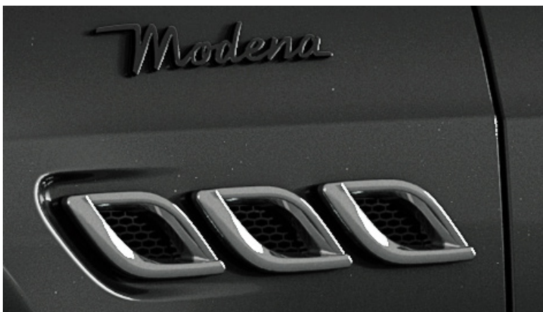
Quattroporte - Side air vents and Badge

Modena version technical specifications.