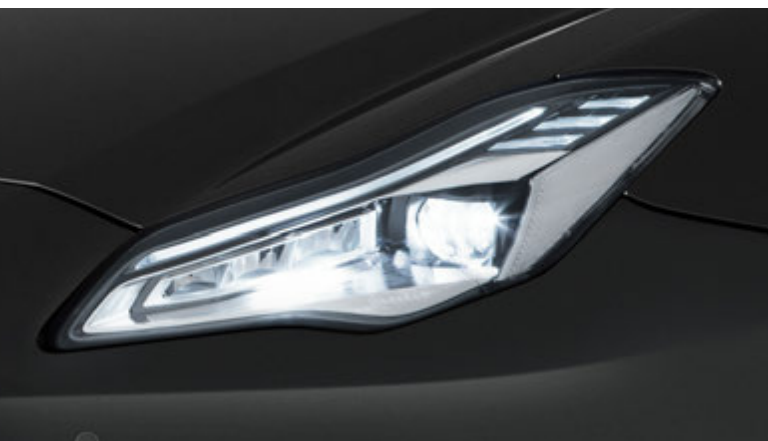
Quattroporte - Front Headlight