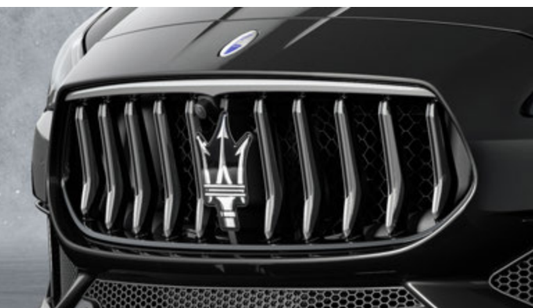
Quattroporte - Grille