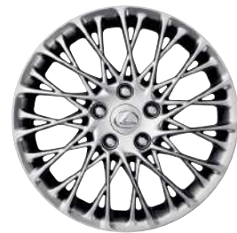
17-in E-Sport alloy wheels 12 AVAILABLE