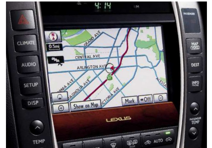
Voice-activated HDD Navigation System 1 with backup camera 3 and Enhanced Bluetooth technology 2,2