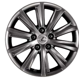
17-in 10-spoke Liquid Graphite-finish alloy wheels 12 (ULTRA-LUXURY PACKAGE*) AVAILABLE