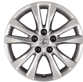
17-in five-split-spoke alloy wheels 12 STANDARD