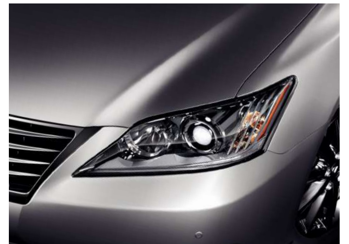
High-Intensity Discharge (HID) headlamps