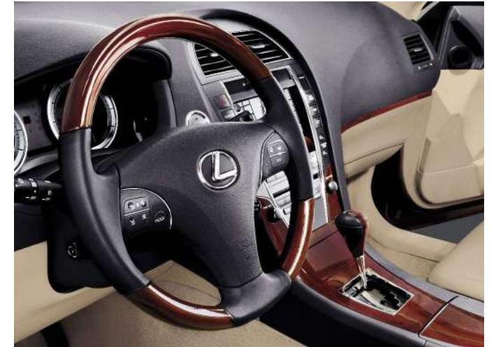
Wood- and leather-trimmed steering wheel and shift knob

Full-size spare tire with 17-in alloy wheel 12