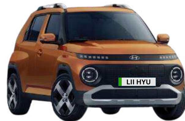
Sienna Orange (Metallic)*