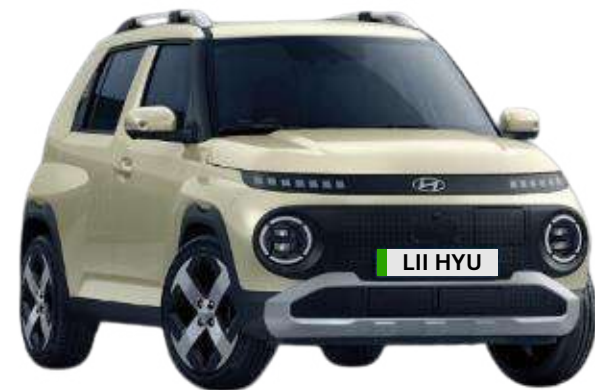
Buttercream Yellow (Pearl)