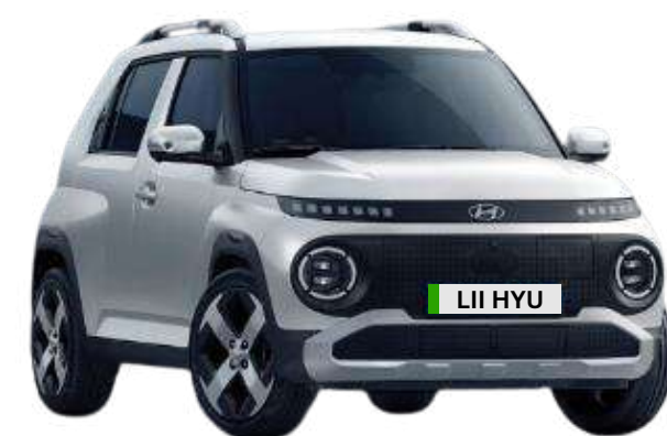
Aero Silver (Matte)*