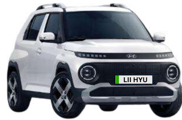
Atlas White (Pearl)*