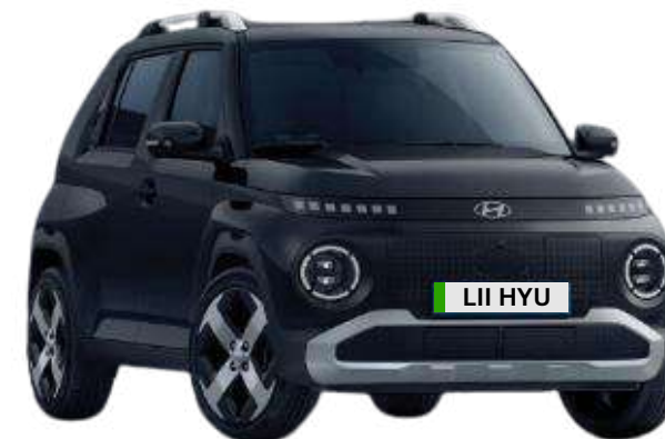
Abyss Black (Pearl)