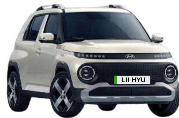
Natural Ivory (Metallic)

Choose from an IN-teresting range of exterior colours to create an all-new INSTER that is best matched to your personal style.