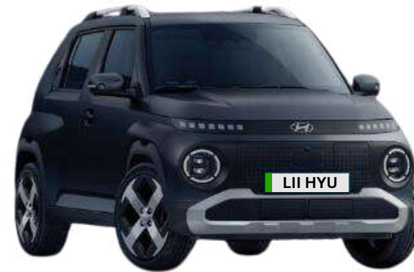
Dusk Blue (Matte)