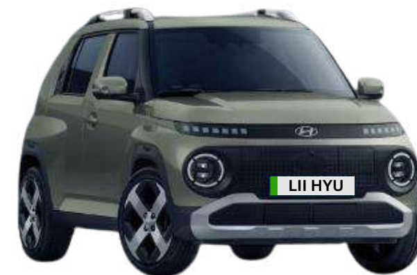
Jungle Khaki (Gloss)*