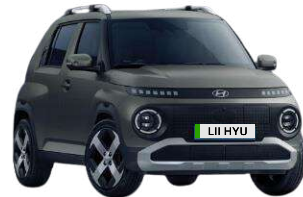
Bijarim Khaki (Matte)