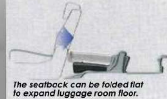
The seatback can be folded flat to expand luggage room floor.

The 50-50 split third row seats can be individually reclined up to 16 degrees with several reclining angle allowing for maximum comfort for the passenger