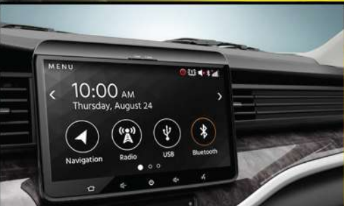
10" Touchscreen Audio Unit