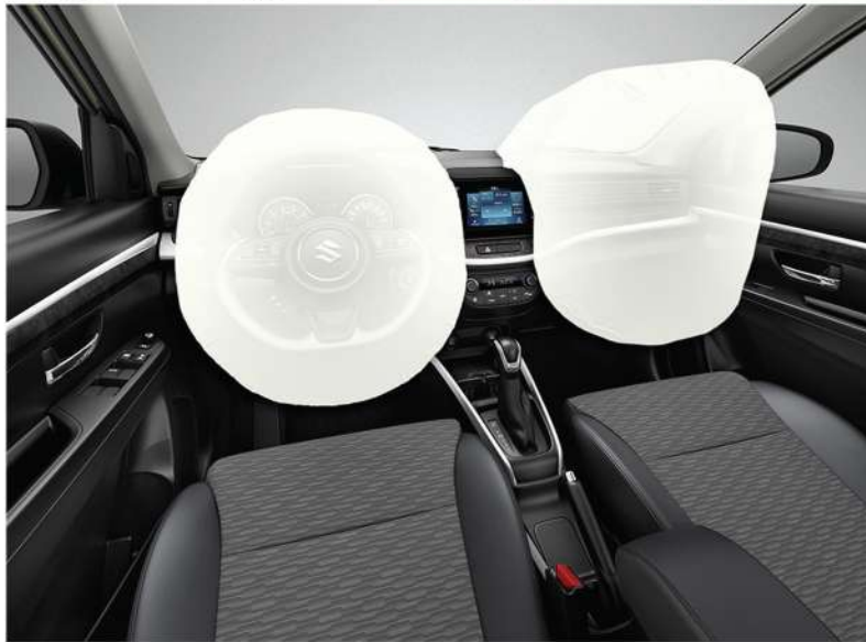
SRS Airbag System