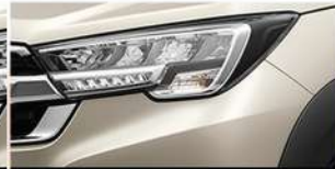
LED Headlamps with DRL