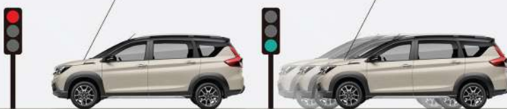
Engine Auto Stop Start System