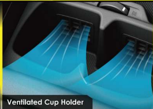
Ventilated Cup Holder