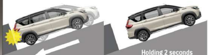
Hill Hold Control