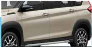
Side Protection Moulding