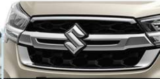
New Grille Design