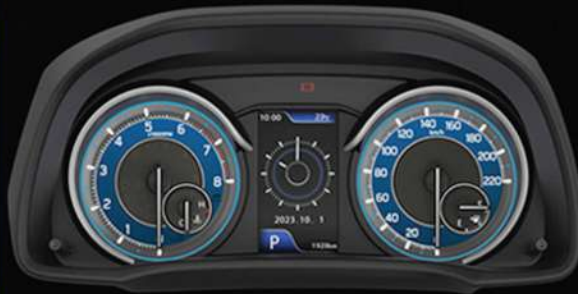
New Stylish and Sporty Meter Cluster