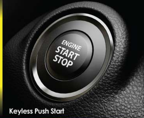
Keyless Push Start