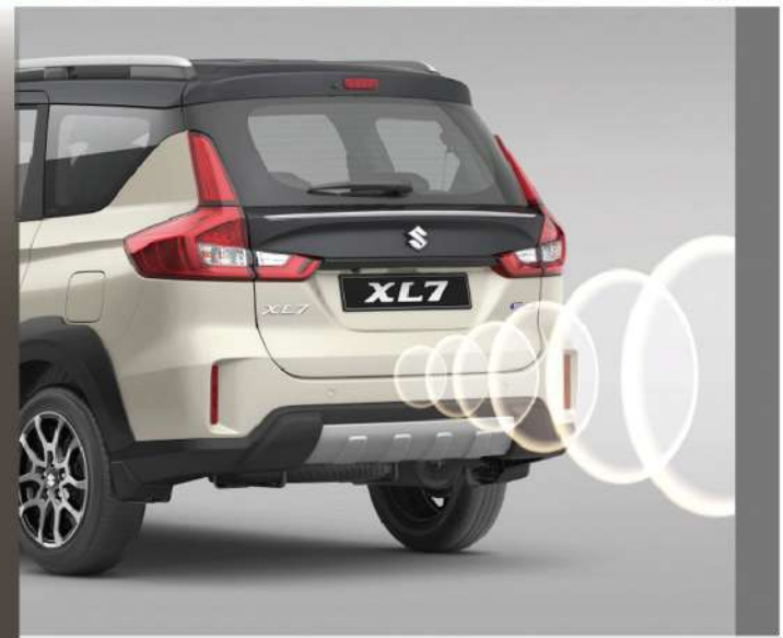
Reverse Parking Sensors and Camera