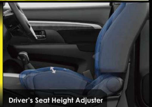
Driver's Seat Height Adjuster