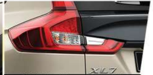
LED Taillamps with Vertical Guide Lights