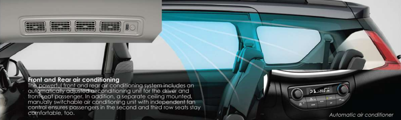
Rear air conditioner