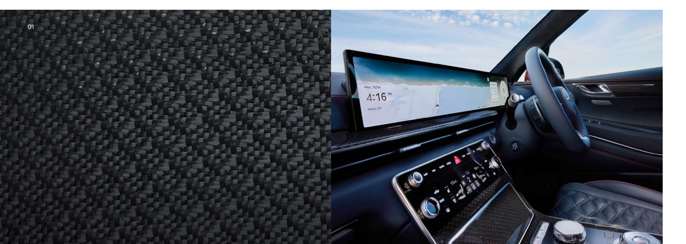
01 Real Carbon Fibre