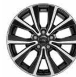
Titanium – 17”

*Please note metallic paint is a chargeable option.