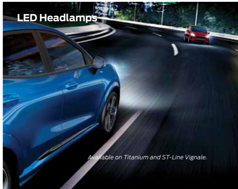
Available on Titanium and ST-Line Vignale.