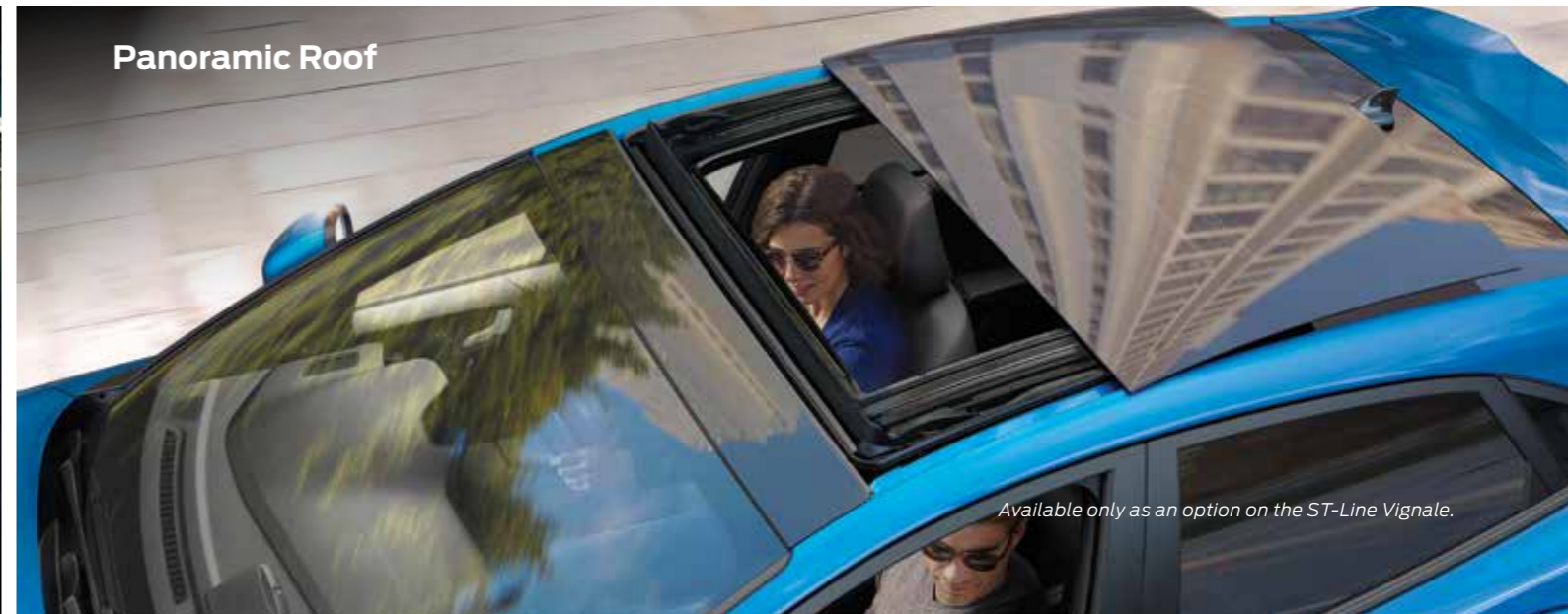
Available only as an option on the ST-Line Vignale.