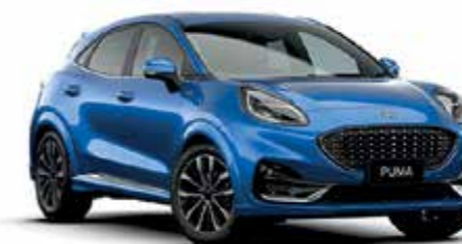
Desert Island Blue*