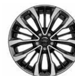
ST-Line Vignale – 18”

10-spoke Black machined finish Alloy wheel