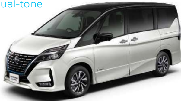
Brilliant White Pearl/Diamond Black (XAM)