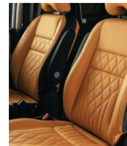
Amber Nappa leather upholstery with diamond quilting*