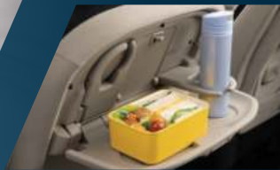
Second-row personal tray table