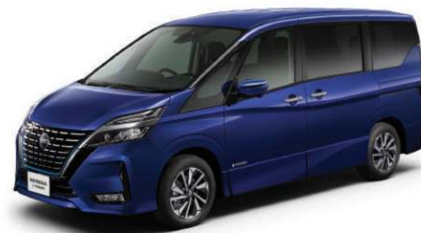
Azure Blue (RBR)