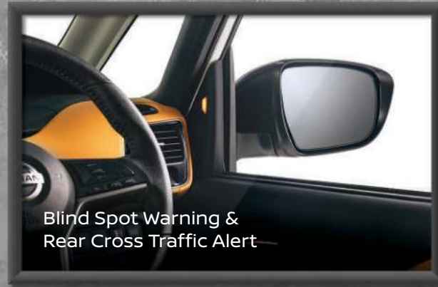
Blind Spot Warning & Rear Cross Traffic Alert