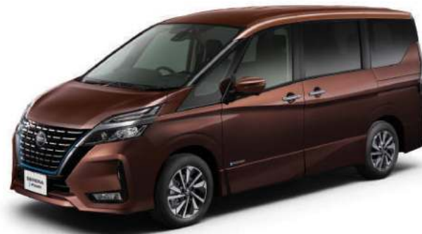
Imperial Umber (CAS)