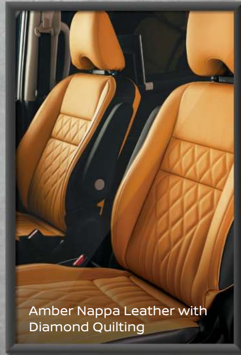
Amber Nappa Leather with Diamond Quilting