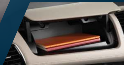
Front passenger dashboard storage compartment

Enjoy convenience on the go with many handy features and thoughtful storage spaces throughout the smart MPV.