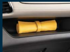
Front passenger tray