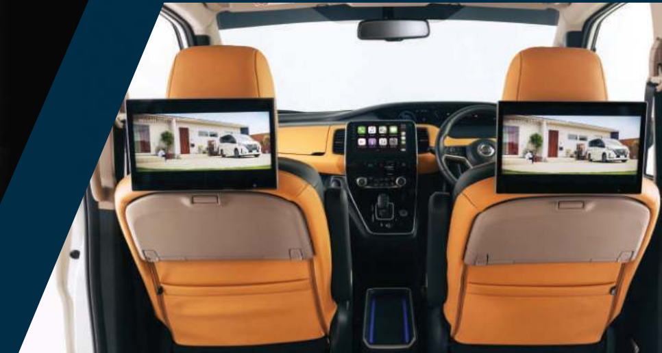
Keep your children entertained with the 12.5-inch Dual Rear Headrest Monitors*