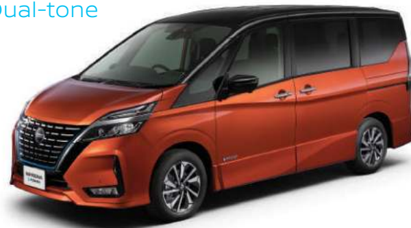
Sunrise Orange/Diamond Black (XFR)