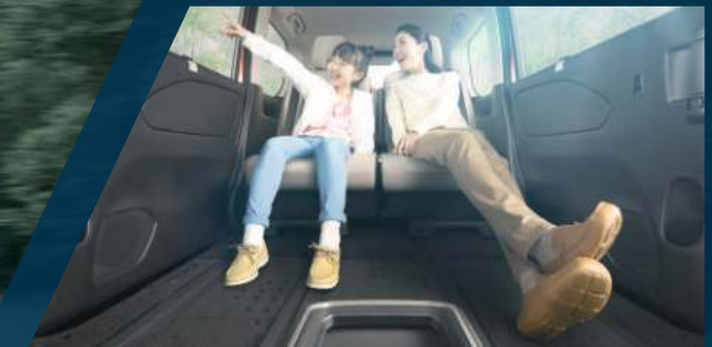
Enjoy a relaxing journey with its 6-way individually-adjusted second-row seats.

Enjoy a comfortable journey with your family in the spacious cabin of the 7-seater Nissan Serena e-POWER. From the first to the third row, this MPV boasts an impressive interior length, width and height to make every ride enjoyable for everyone.