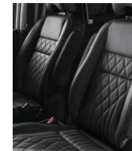
Black Nappa leather upholstery with diamond quilting