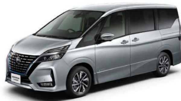
Brilliant Silver (K23)