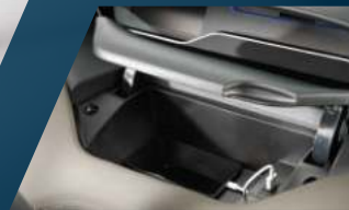
Driver's upper and lower dashboard storage compartment