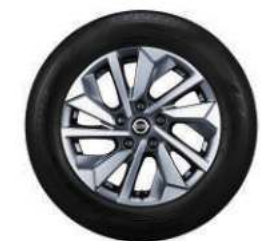
16-inch alloy wheels