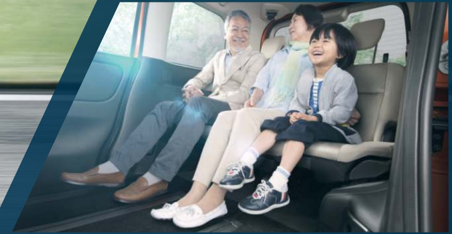
Spacious legroom for your third-row passengers.