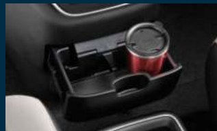
Cup holders with hooks