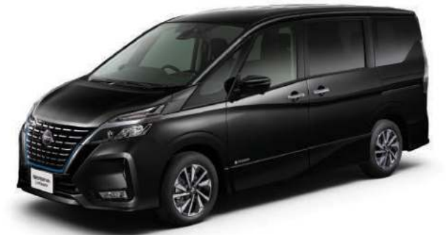
Diamond Black (G41)