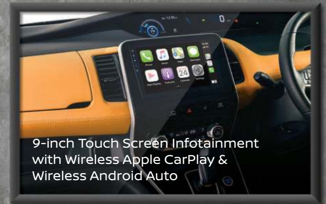
9-inch Touch Screen Infotainment with Wireless Apple CarPlay & Wireless Android Auto