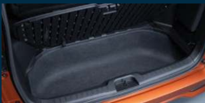
Large capacity underfloor storage compartment