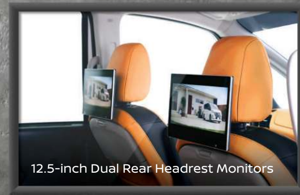
12.5-inch Dual Rear Headrest Monitors