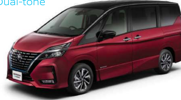
Red Pearl/Diamond Black (XAN)