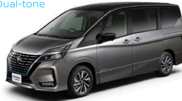
Dark Metal Grey/Diamond Black (XCX)