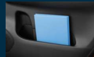
Front door pocket with bottle holder