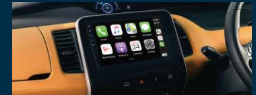
9-inch Touch Screen Infotainment with Wireless Apple CarPlay & Wireless Android Auto