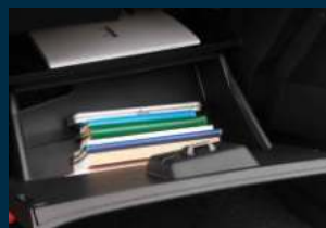
Large glove box with damper