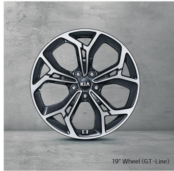
19" Wheel (GT-Line)