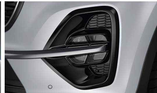
New Ice Cube Fog Lamps**