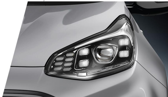
Automatic LED Headlamps with Escort Function