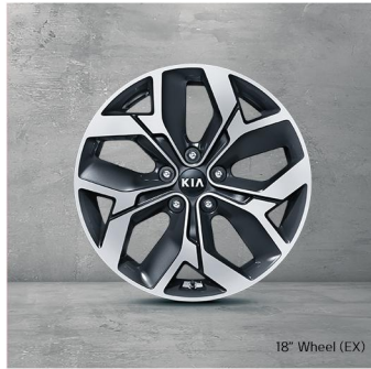
18" Wheel (EX)