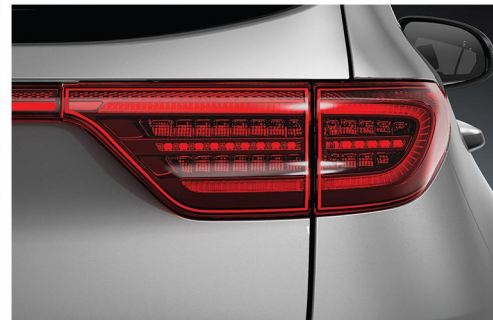
New Rear Combination LED Lamps**