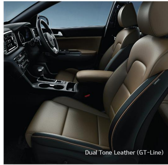
Dual Tone Leather (GT-Line)