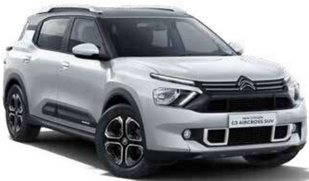
POLAR WHITE BODY WITH PLATINUM GREY ROOF