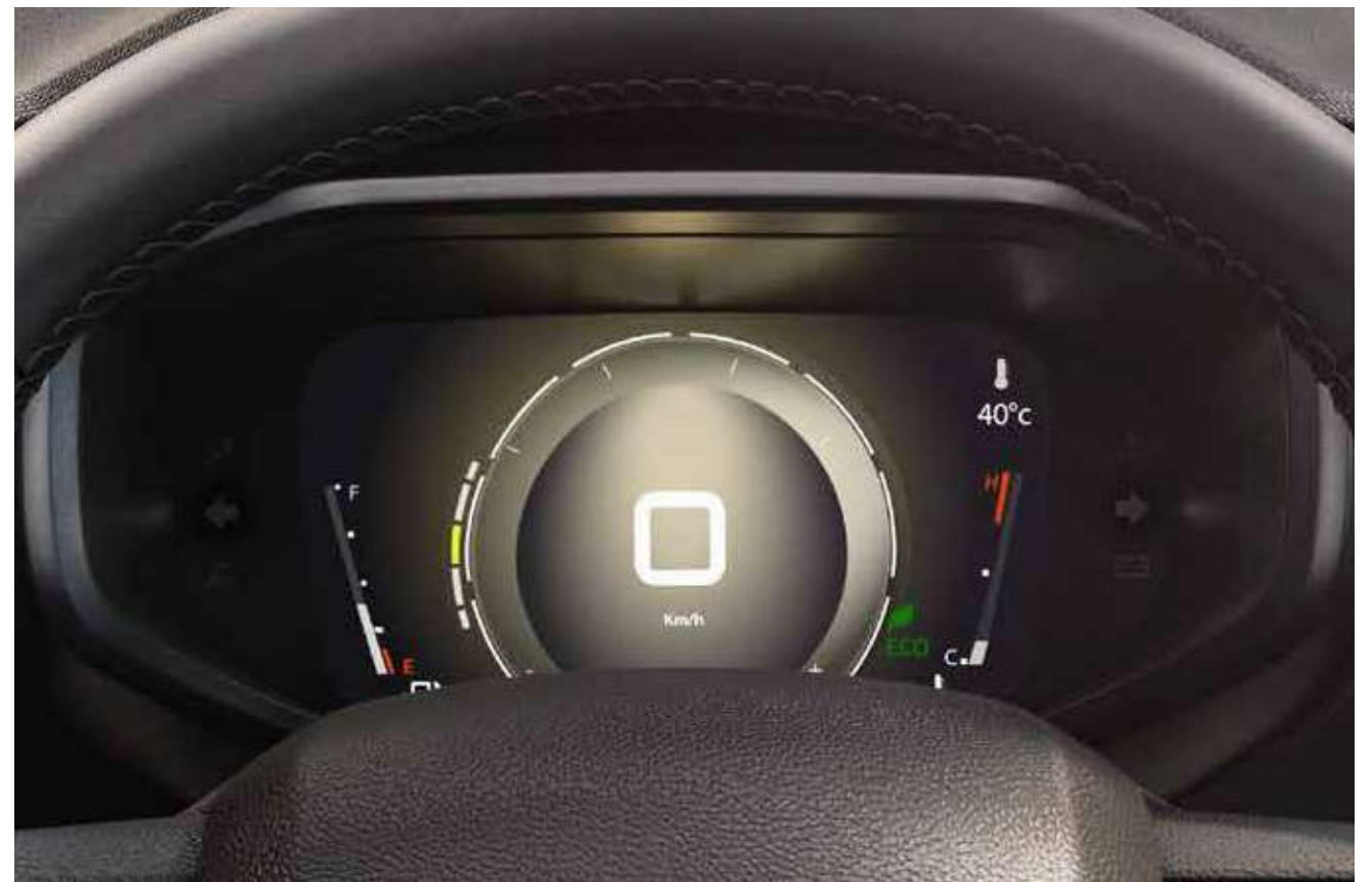
DIS WITH BRONZE THEME