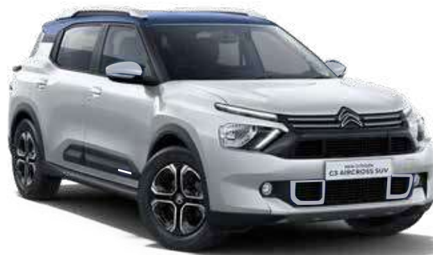
POLAR WHITE BODY WITH COSMO BLUE ROOF