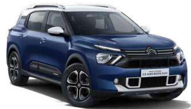
COSMO BLUE BODY WITH POLAR WHITE ROOF