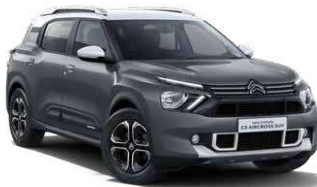
PLATINUM GREY BODY WITH POLAR WHITE ROOF