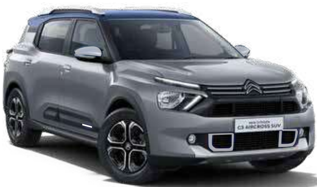
STEEL GREY BODY WITH COSMO BLUE ROOF