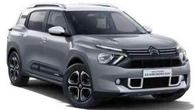
STEEL GREY BODY WITH POLAR WHITE ROOF