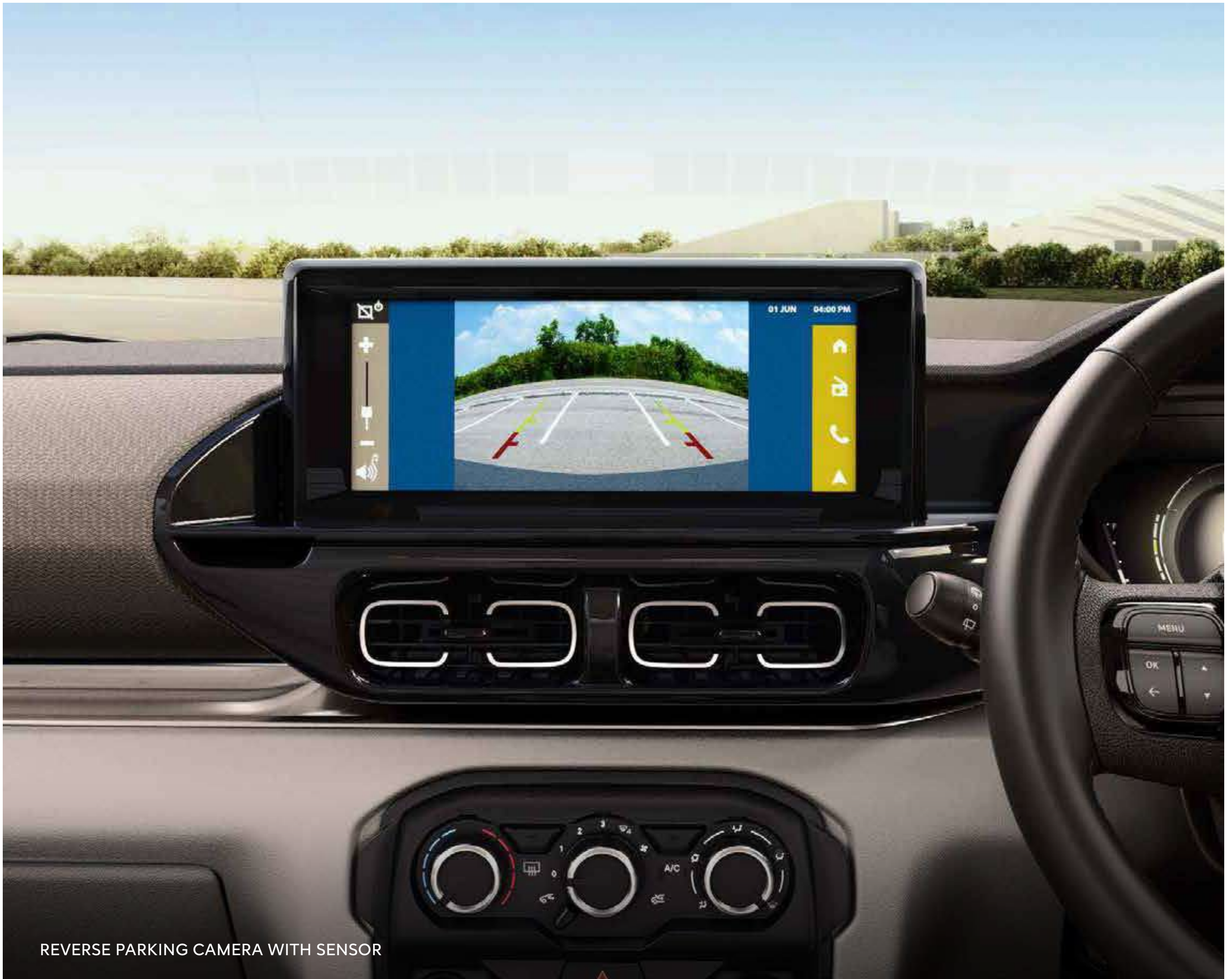
REVERSE PARKING CAMERA WITH SENSOR