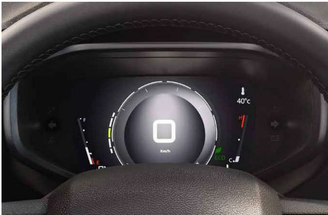
DIS WITH GREY THEME