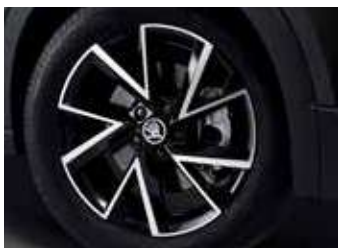
Vega Dual Tone Alloys