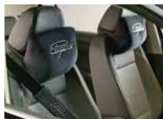
'Elegance' Seat-Belt Cushions & Neck Rests