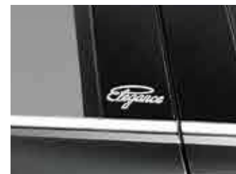
'Elegance' Badge on B-Pillar