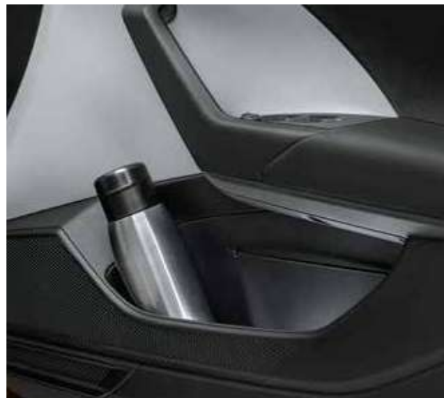
Storage In the Front and Rear Doors