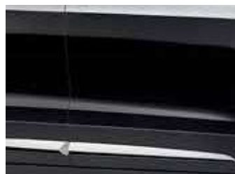
Body Side Molding Chrome