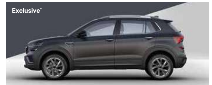
Kushaq Matte Edition