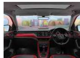
Red Ambient Lighting with Ruby Red Metallic Décor