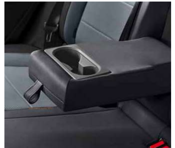
Cupholders In Armrest