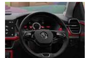
20.32cm Škoda Virtual Cockpit with Red Theme