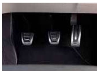
Textile Mat & Aluminium Pedal