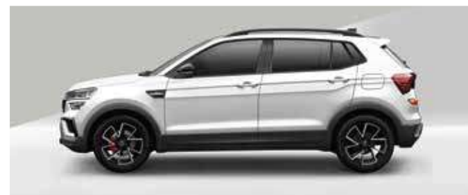
Monte Carlo - Candy White with Carbon Steel Painted Roof