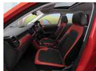
Monte Carlo Incribed Ventilated Red & Black Front Leather Seats