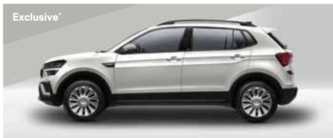
Kushaq Onyx - Candy White