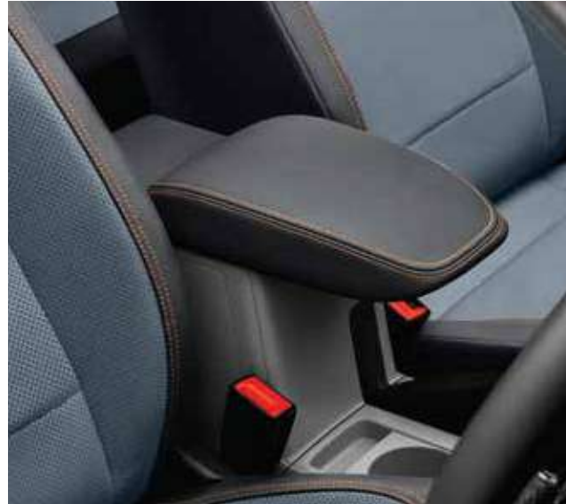
Storage In Front Centre Armrest