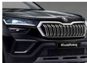
Radiator Chrome Grill