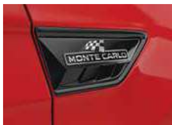
Monte Carlo Fender Garnish