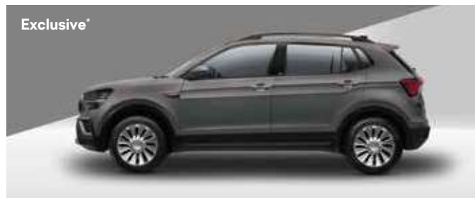
Kushaq Onyx - Carbon Steel