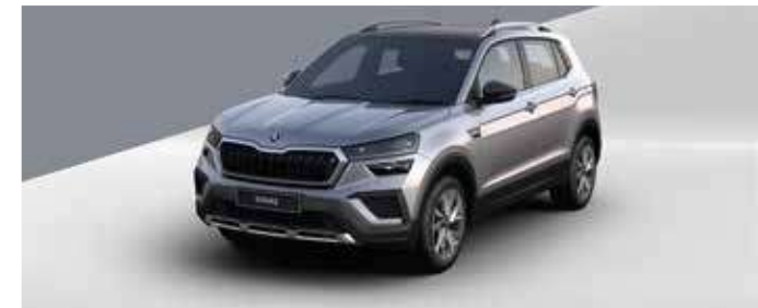
Brilliant Silver With Carbon Steel Roof