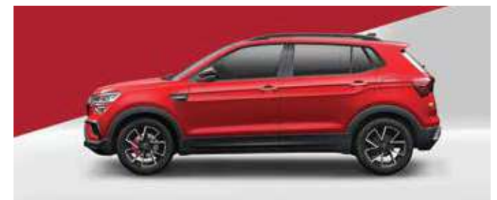
Monte Carlo - Tornado Red with Carbon Steel Painted Roof