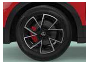
R17 Dual-tone Vega Alloy Wheels With Red Brake Calipers*