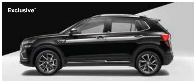
Elegance Edition - Deep Black