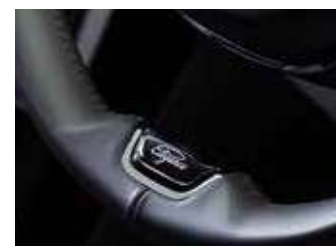
Steering Wheel 'Elegance' Badge