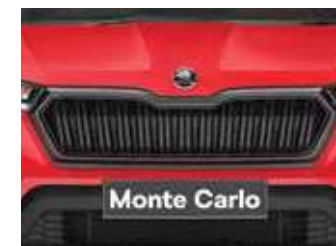
Škoda Signature Grille With Glossy Black Surround