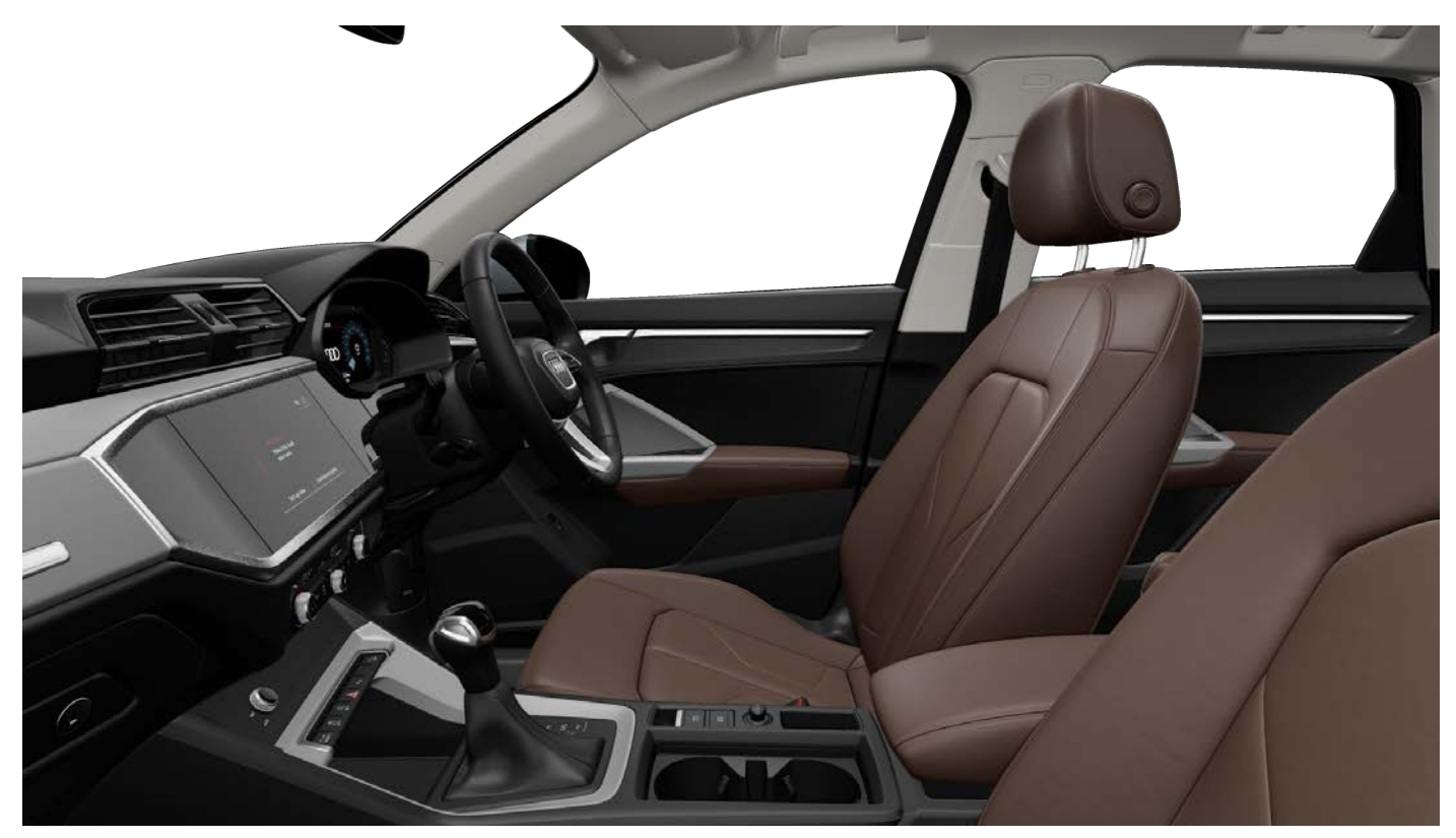
Okapi Brown/Black Leather Interior (Option Code ML)