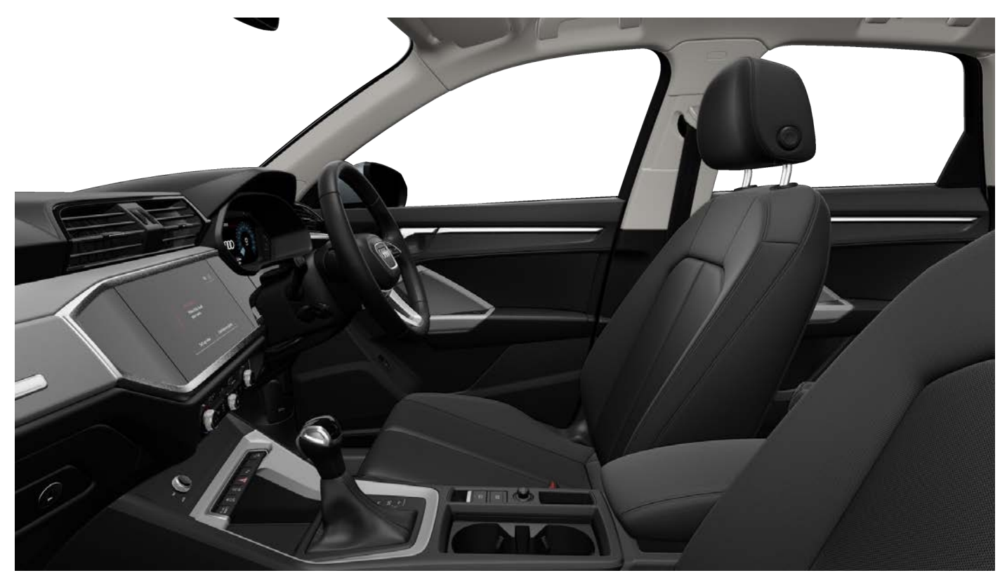
Black/Black Cloth Interior (Option Code FZ)