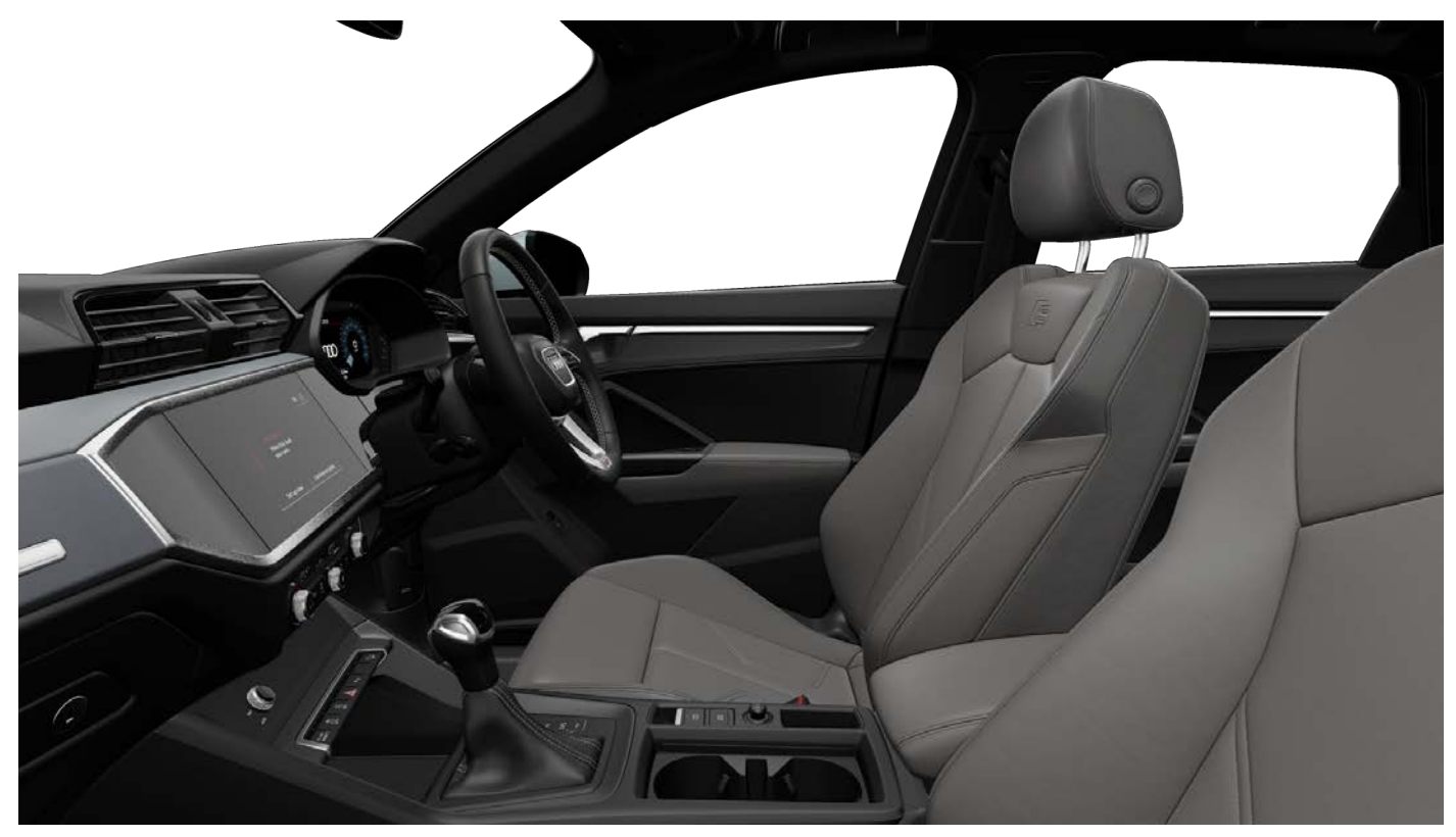
Rotor Grey/Black Leather Interior (Option Code OQ)