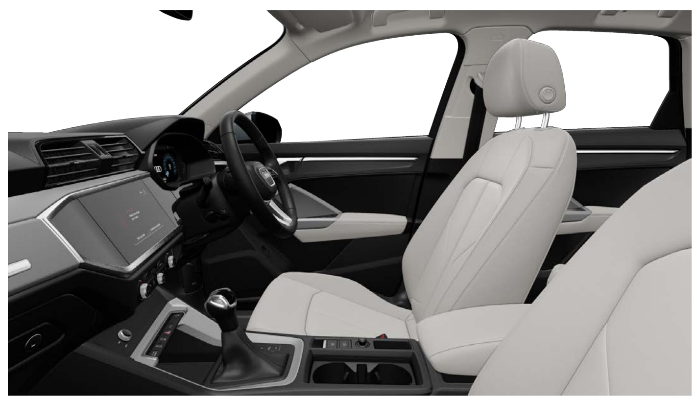
Beige/Black Leather Interior (Option Code GC)