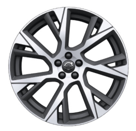
21" 7 Open Spoke (#800133)