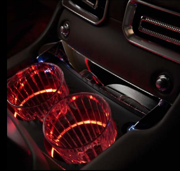
Every detail in the AURUS interior is designed for untroubled relaxation. The four-zone climate-control system furnishes individual temperature conditions for each passenger. A variety of lighting options emphasize the beauty of the interior and allow the customization of the interior lighting, depending on the time of day and the passengers mood.