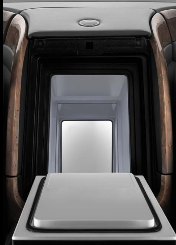
A minibar, folding tables and AURUS-branded crystal glasses, waiting for their finest hour in an elegant built-in box, are also at the passengers' disposal.