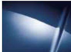
ETERNAL BLUE PEARL