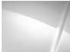
SATIN SILVER METALLIC