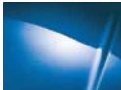
ARCTIC BLUE PEARL