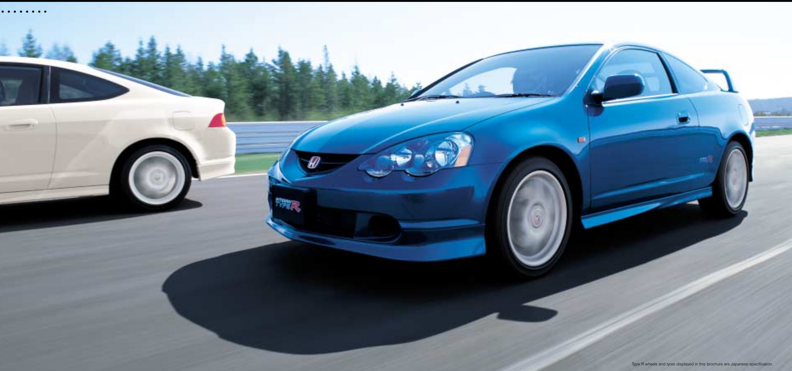
Type R wheels and tyres displayed in this brochure are Japanese specification.