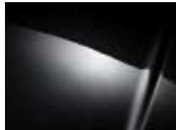
NIGHTHAWK BLACK PEARL