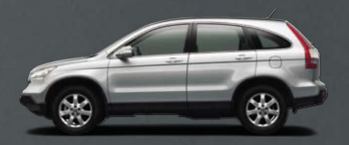
Alabaster Silver Metallic* Interior trim: Black