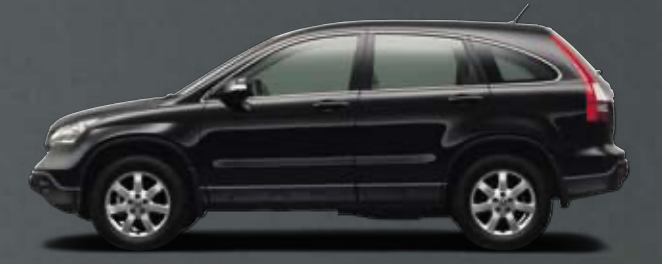
Nighthawk Black Pearl* Interior trim: Black or Ivory

Obviously the world would be a better place and the good news is, such a car already exists: The FCX Clarity. It works by converting hydrogen into electricity, which leaves you with only one emission, H2O. And in 2008, this totally new fuel-cell vehicle will be in production.