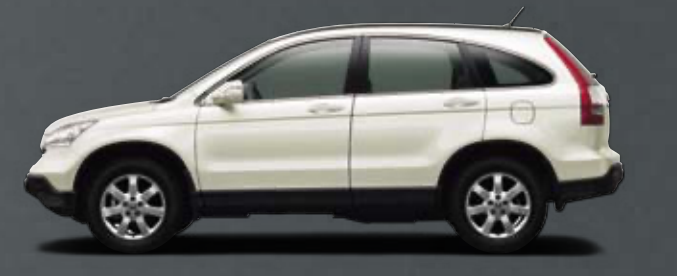
Taffeta White Interior trim: Ivory