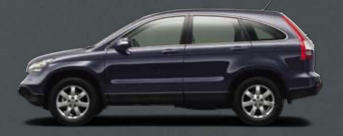
Sparkle Grey Pearl* Interior trim: Black

* Metallic / Pearlescent paint additional cos