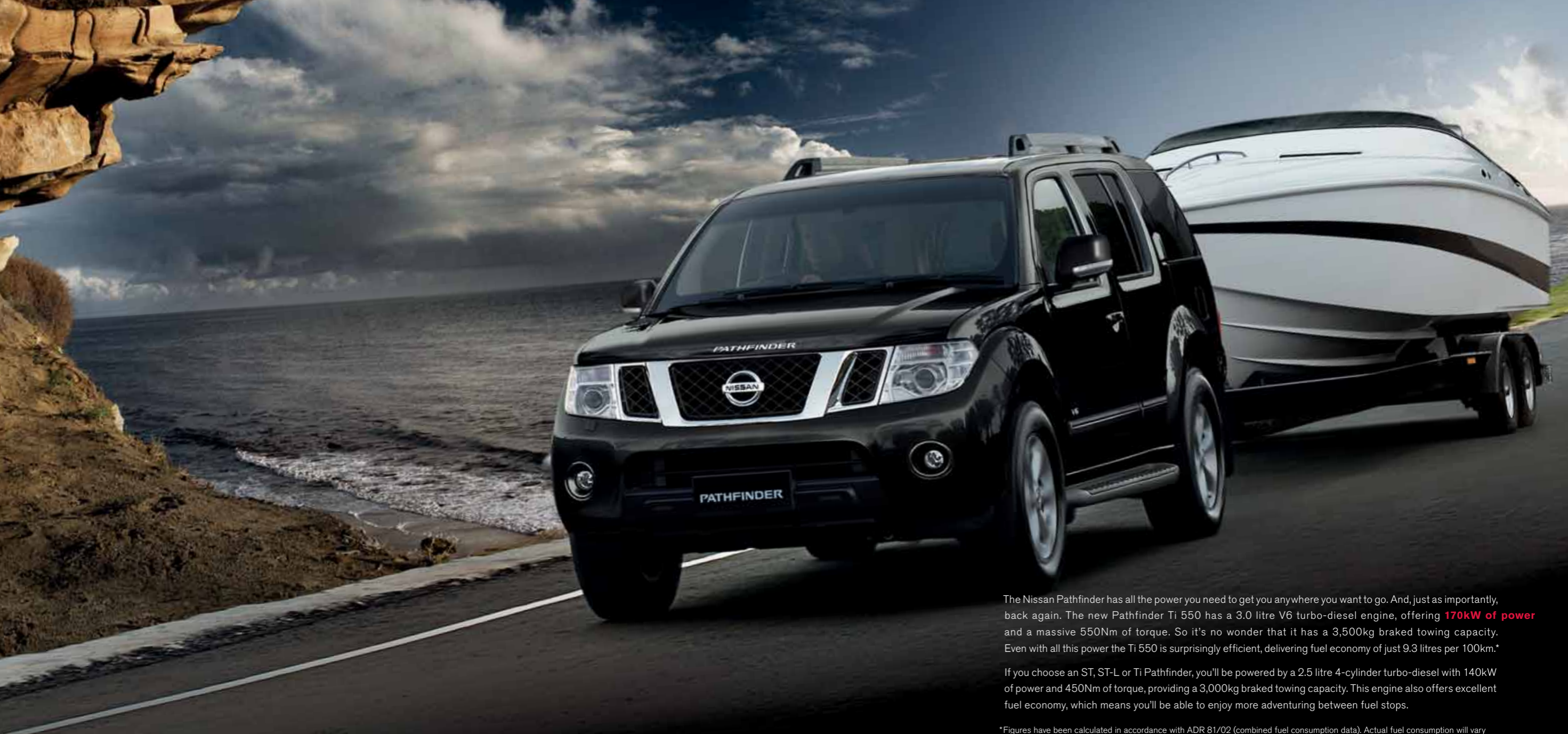
Midnight Black Ti 550.

The Nissan Pathfinder has all the power you need to get you anywhere you want to go. And, just as importantly, back again. The new Pathfinder Ti 550 has a 3.0 litre V6 turbo-diesel engine, offering 170kW of power and a massive 550Nm of torque. So it's no wonder that it has a 3,500kg braked towing capacity. Even with all this power the Ti 550 is surprisingly efficient, delivering fuel economy of just 9.3 litres per 100km.*