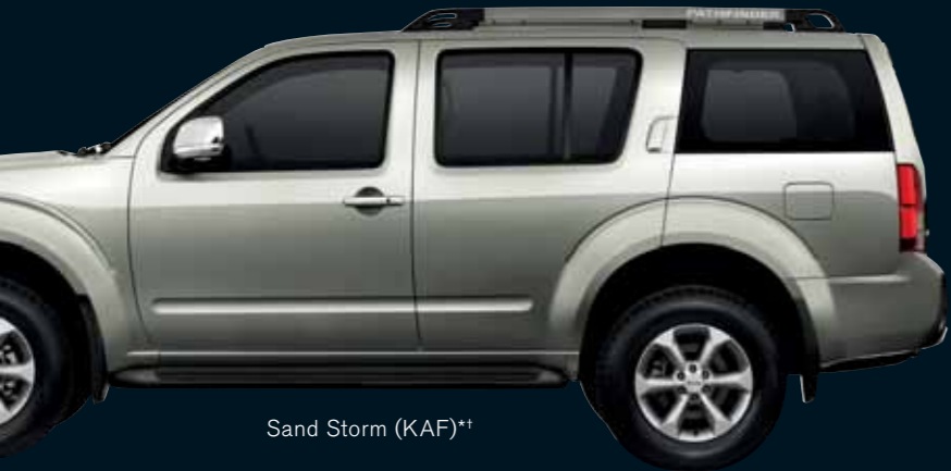
Sand Storm (KAF)**