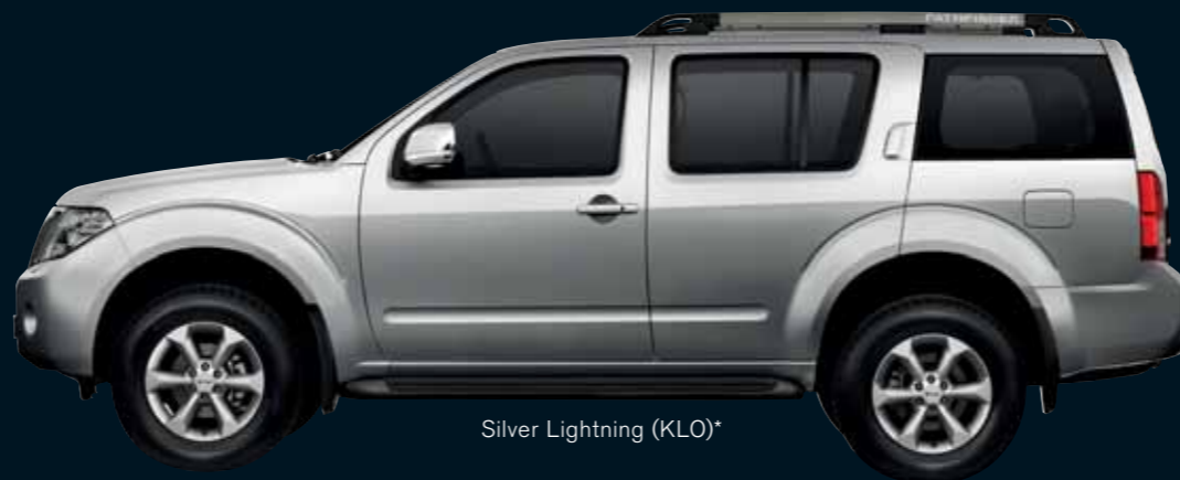
Silver Lightning (KLO)*