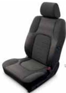
Luxury cloth seat trim ST.

All illustrations, information and specifications presented and referred to in this brochure were correct at the time this brochure was approved for printing. The colours in the photographs may vary from actual colours. However, Nissan Motor Co (Australia) Pty. Ltd. reserves the right, subject to the laws of Australia and/or the regulations of any competent authority which may apply from time to time, at its discretion at any time and without prior notice, to discontinue or change the models, features, specifications, designs and prices of the products referred to in this brochure and any optional equipment therefore without incurring any liability whatsoever to any purchaser or prospective purchaser of any such products. Some of the items referred to herein are optional at extra cost. Some options may be required in combination with other options. Always consult your Nissan Dealer for the latest information on models, specifications, features, prices, options and availability. Nissan Motor Co (Australia) Pty. Ltd. ACN 004 663 156. Printed February 2011. PTH0314