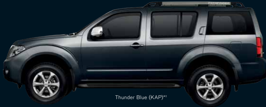
Thunder Blue (KAP)**