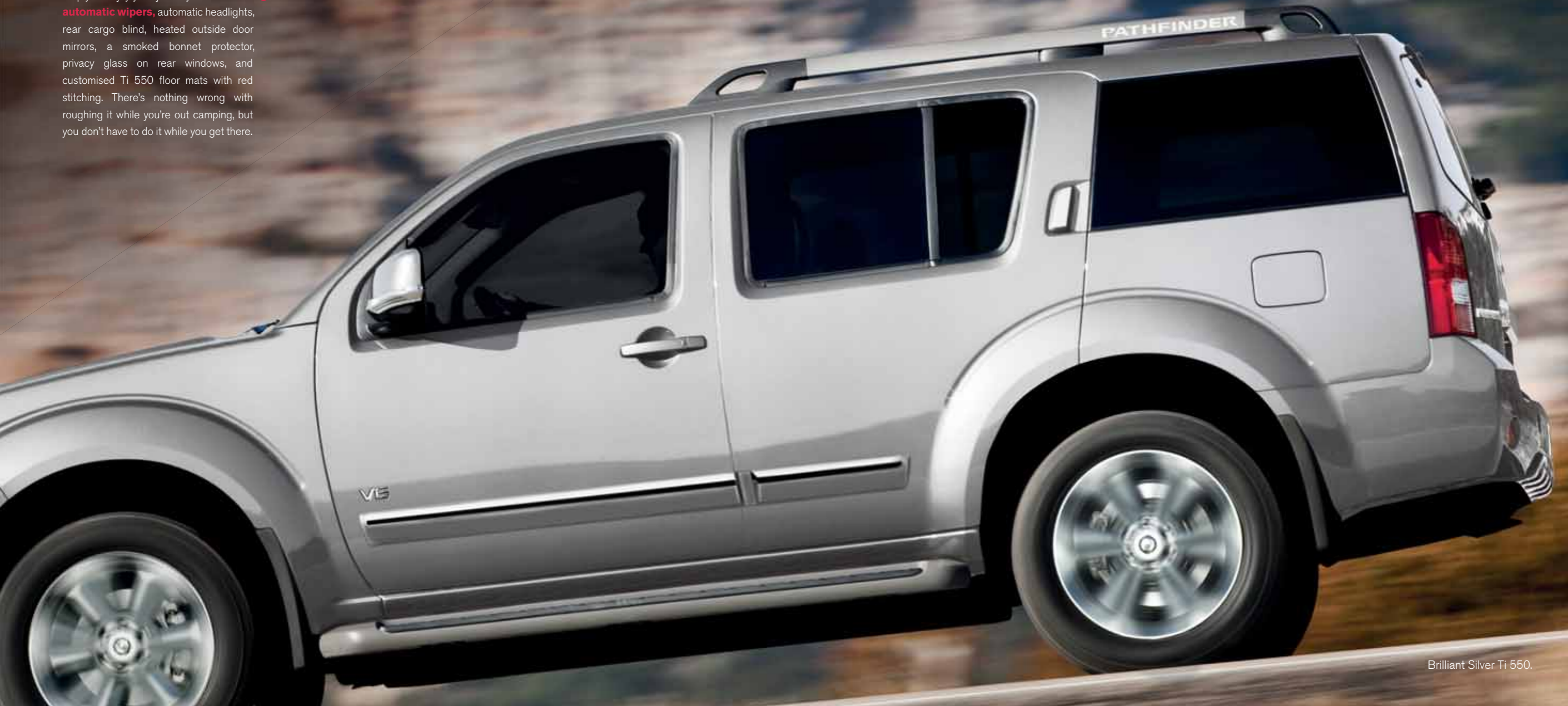
Brilliant Silver Ti 550.

The new Nissan Pathfinder Ti 550 comes with a huge list of standard features to help you enjoy your journey. Rain sensing automatic wipers , automatic headlights, rear cargo blind, heated outside door mirrors, a smoked bonnet protector, privacy glass on rear windows, and customised Ti 550 floor mats with red stitching. There's nothing wrong with roughing it while you're out camping, but you don't have to do it while you get there.