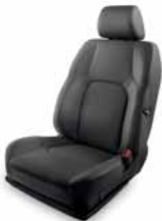
Leather seat trim ST-L, Ti and Ti 550.