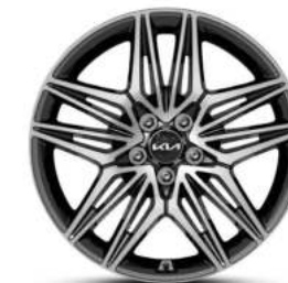
19" machined-finish alloy wheels