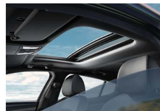
Full-width power sunroof