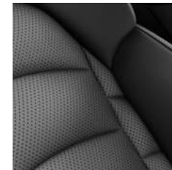
GT Elite Black Nappa leather