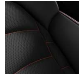
GT Elite Suede Package

*Not available with California Red exterior.