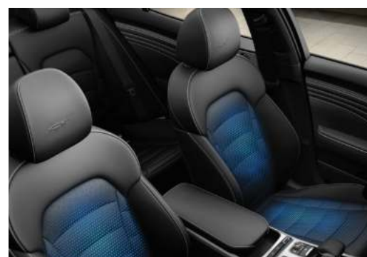
Heated and air-cooled front seats