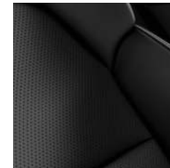
GT Limited Black leather