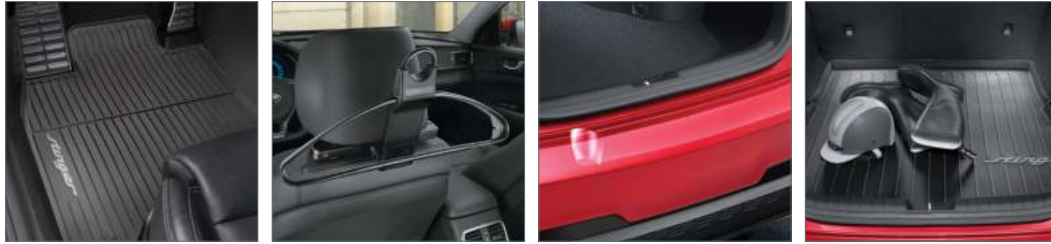
All-weather floor mats

Built to fit right, work right and look great.