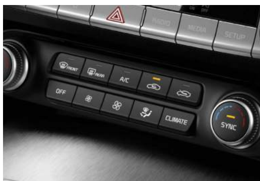
Dual-zone automatic climate control

Sporty, yet spacious and uncluttered, and with available premium Nappa leather or leather with suede trim seating, Stinger's cabin will indulge you with comfort and confidence.