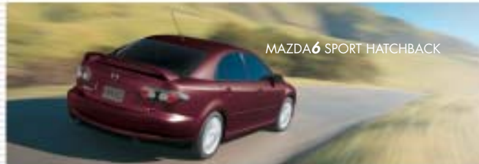
MAZDA6 SPORT HATCHBACK