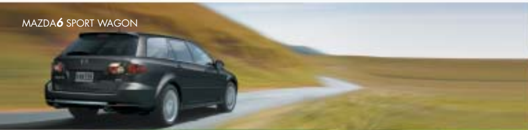
MAZDA6 SPORT WAGON