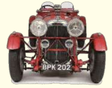
M45R images