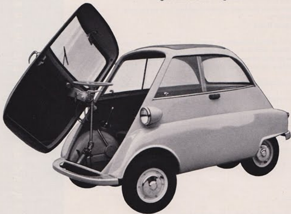
The Export Model 57 with right or left-hand steering.

We think you will agree with us that in the BMW Isetta standard model with folding roof, the drop-head Cabriolet and the Tropical model, we have a trio of outstanding cars. Admittedly these handsome new Isettas for export are more expensive, but among many other improvements the specification now includes an efficient air-conditioning system, with all the advantages this gives for driving throughout the year in any sort of weather and, in fact, in all climates. An additional attraction is that the BMW Isetta is now available with left or right-hand steering, also with tubeless tyres.