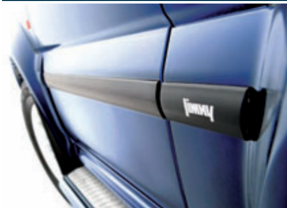
Side body moulding set