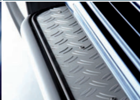
Stainless steel side step