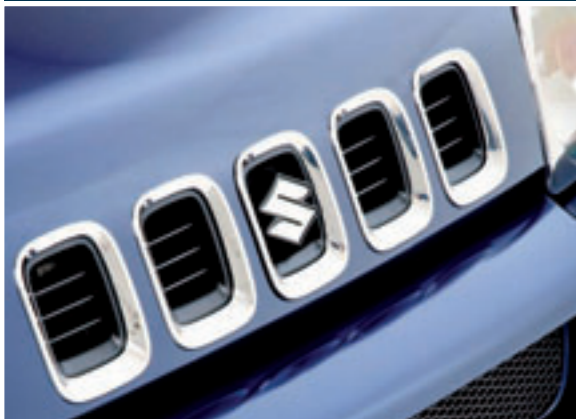
Front grille trim set