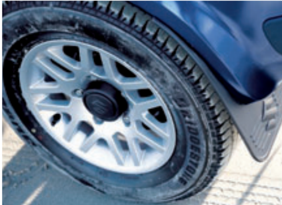
Jakarta alloy wheel