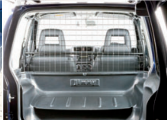
Partition grille/Dog guard