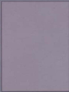
Polar silver metallic D1