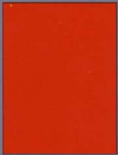
Laser red H1