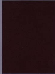
Ruby red pearl effect X6