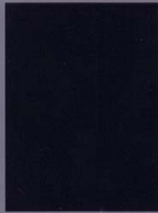
Volcano black pearl effect W9