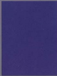
RS blue pearl effect M8