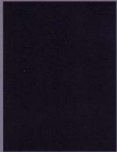
Amethyst grey pearl effect B2