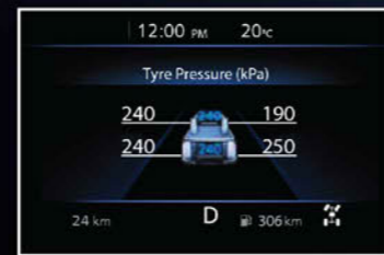
Tyre Pressure Monitoring System**