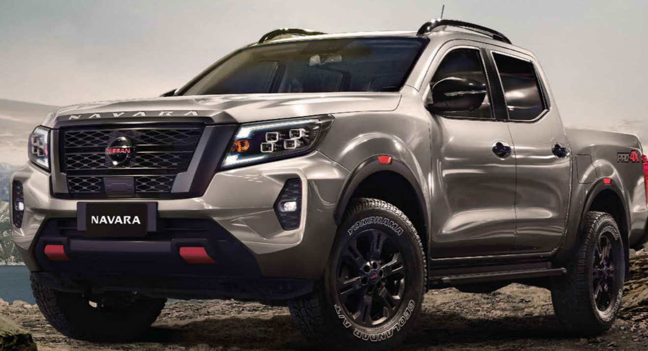
NAVARA 2.5L PRO-4X

It's all about confidence. The feeling that whatever you want to do, wherever you want to go, you can count on the Navara to take you there. So get ready to take it to the next level, and make every day an adventure, with capability that opens up a whole new world for you to explore. The Navara is loaded with the tech you need, so you're ready to shift into 4x4 and cruise rolling dunes or climb up a fire trail with unmatched capability. And do it all with big, bold style. The new Nissan Navara. Geared to excite. Pure, authentic, and ready for whatever comes next.