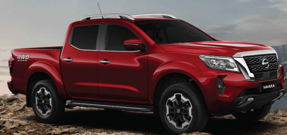
NAVARA 2.5L VL AUTO