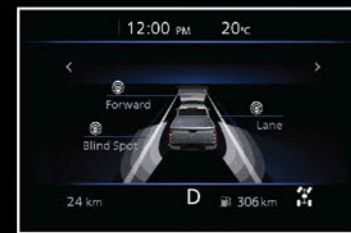
Visual Driving Aids for Nissan Intelligent Mobility

It's easy to be in control of the situation with Navara's Advanced Drive-Assist Display . Helping keep your eyes on the road with less looking away means you're focused and relaxed whether you're dodging boulders or negotiating city traffic. Navara's 7" Advanced Drive-Assist Display* puts up to 8 key information right where you want it. With a quick look down, you can get info on everything from music information to key driver's aid alerts. The system can even monitor your driving and suggest when you may need to take a break or stop for coffee.