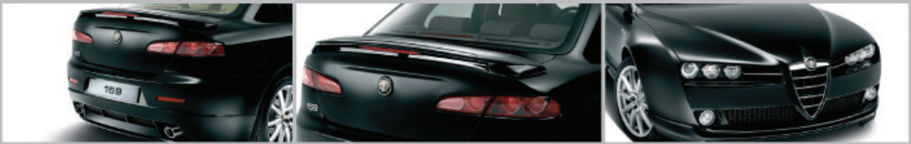
Rear bumper spoiler