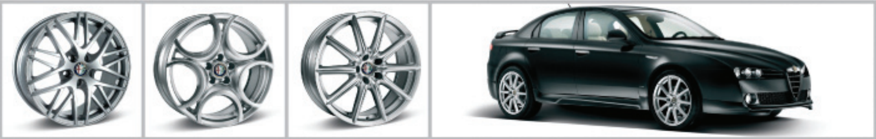
17" alloy kit