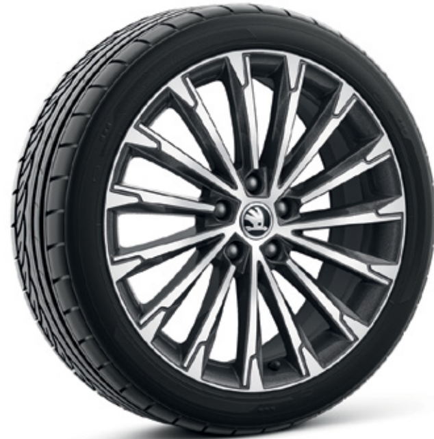
19" BECRUX Anthracite alloy wheels (standard)