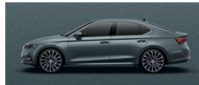
QUARTZ GREY METALLIC