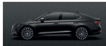
MAGIC BLACK PEARL

Please note that metallic, pearl and premium paint are optional at extra cost. The print process does not allow for exact reproduction of the exterior or the upholstery colours. Please contact your ŠKODA Dealer for further information on colours and upholstery combinations. ° Leather appointed seats have a combination of genuine and artificial leather, but are not wholly leather.