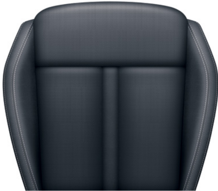
Leather appointment upholstery ° with cushion depth adjustment (standard)