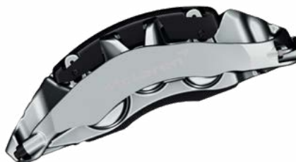
Liquid Silver with Silver machined McLaren logo