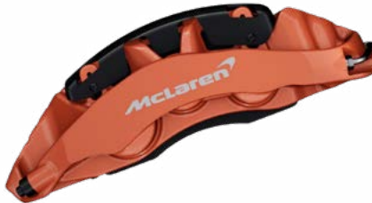
Nardo Orange with Silver machined McLaren logo