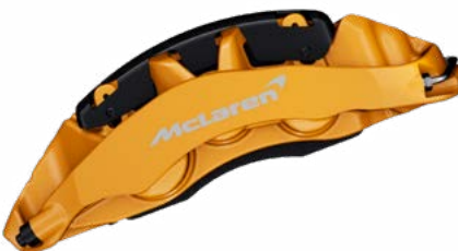
McLaren Orange with Silver machined McLaren logo