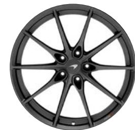
Stealth with laser etched 765LT branding

Ultra-Lightweight 10-Spoke Forged Alloy Wheels