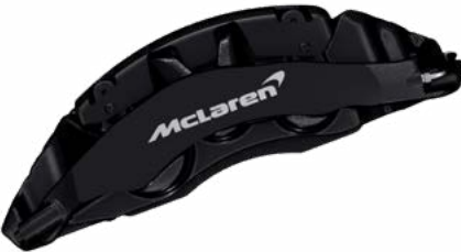
Black with Silver machined McLaren logo