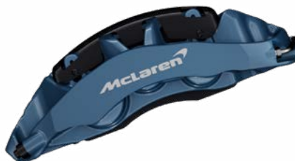
Azura Blue with Silver machined McLaren logo