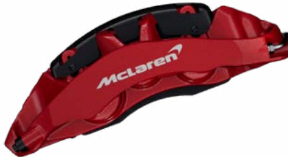
Red with Silver machined McLaren logo