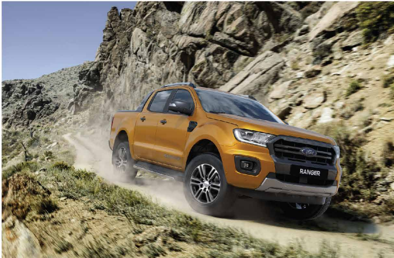
ប្រព័ន្ធនប់ជំនិះរថយន្តពេលបើកបរលើផ្លូវកោង អិលនិង បញ្ចៀសការក្រឡាប់