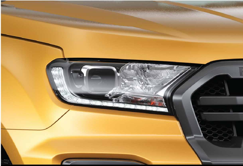
ចង្កៀងកុដ LED រូបរាងថ្មីក្តីច្បាស់ល្អ និងចង្កៀង LED បំភ្លឺនៅពេលថ្ងៃ