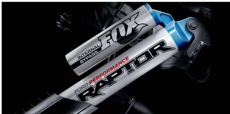
បំពាក់ប្រមូល FOX Racing Shox