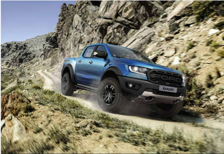
ប្រព័ន្ធនប់ជំនិះរថយន្តពេលបើកបរលើផ្លូវភោង រអិលនិង បញ្ចៀសការក្រឡាប់