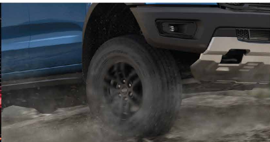
Rock Crawl Mode