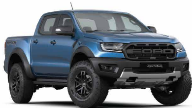
Ford Performance Blue