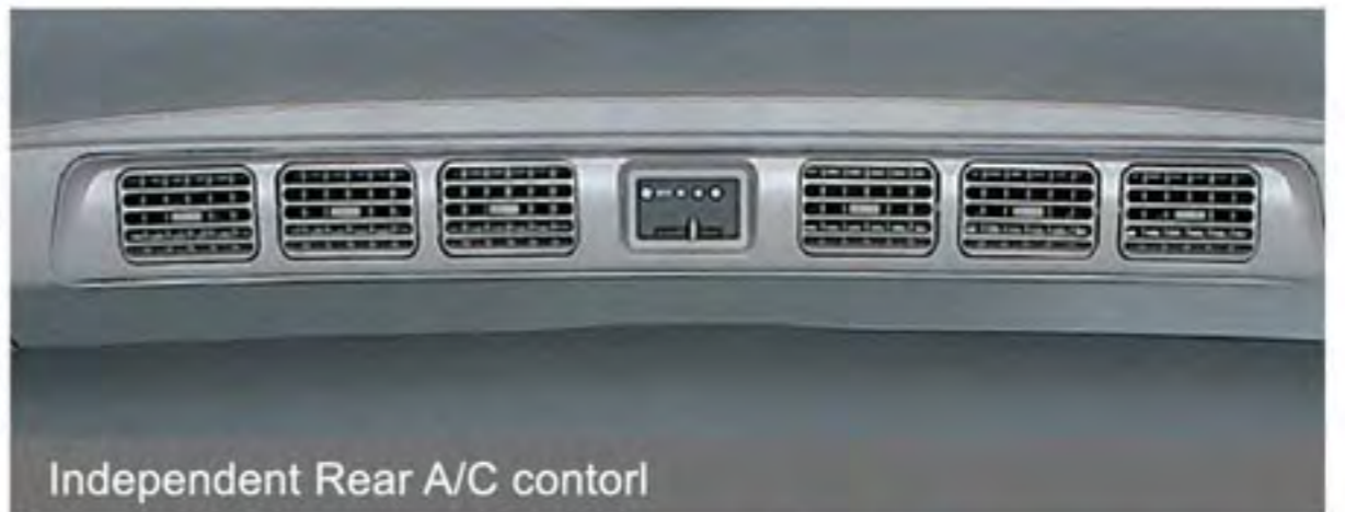
Independent Rear A/C control