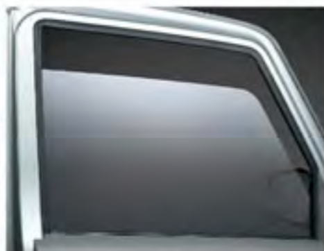
Fr Power Window