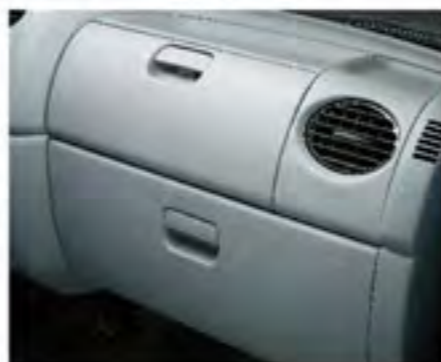
Two-Layer Glove Box