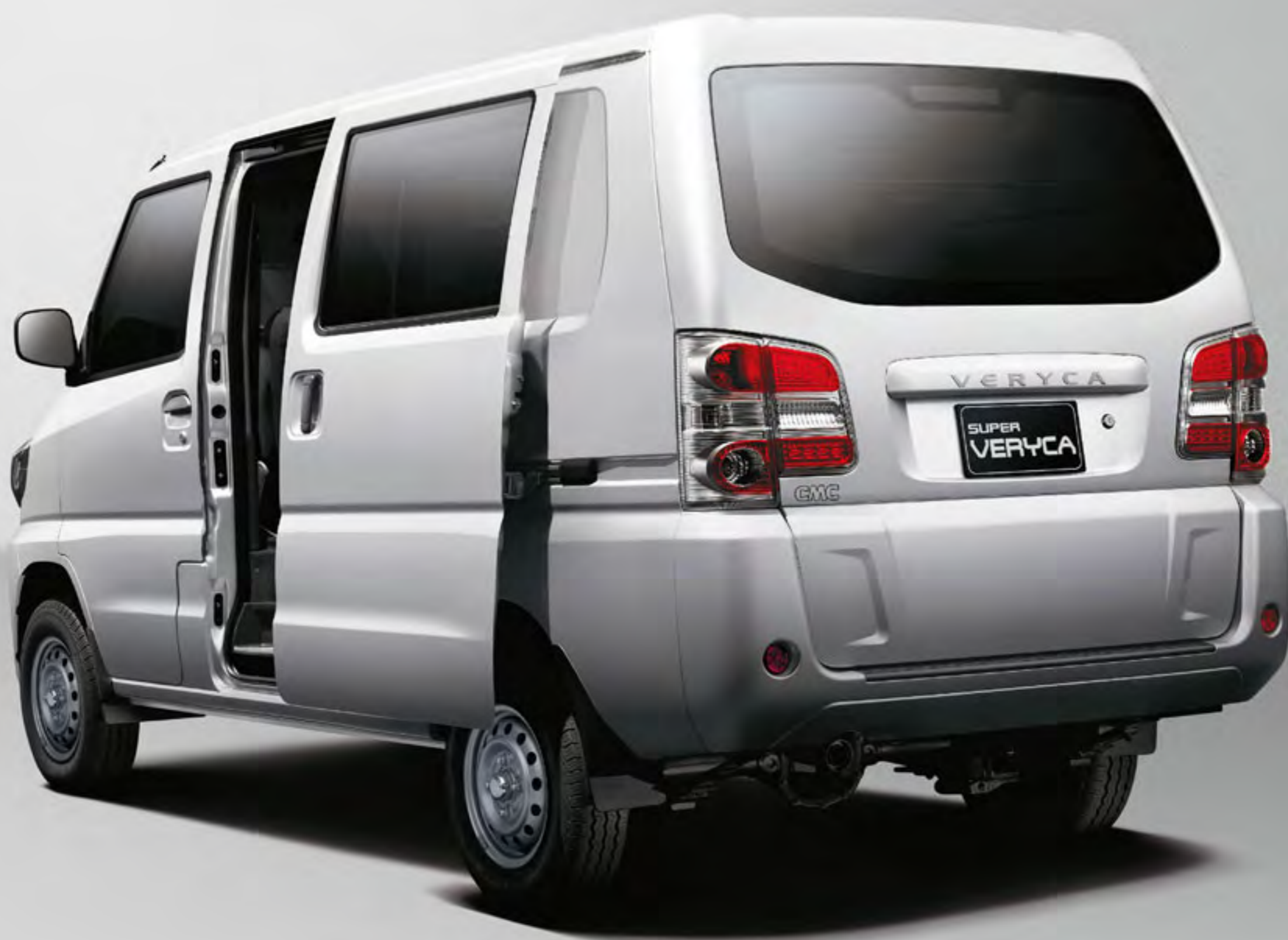
1.3 L 5 Seats Semi-Panel Van

Designed for business or family use, Super Veryca makes your life easier.