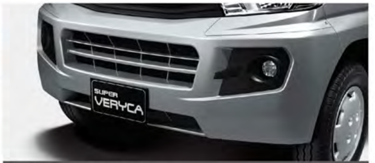
New-Design Front Bumper