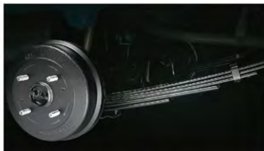
Leaf Spring Rear Suspension