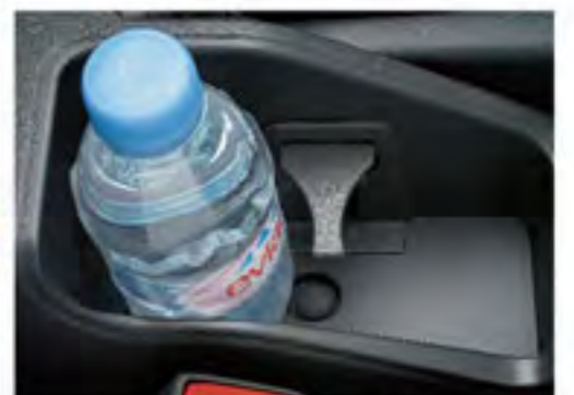
Fr Seat Cup Holder