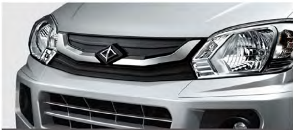
Chromed Radiator Grille