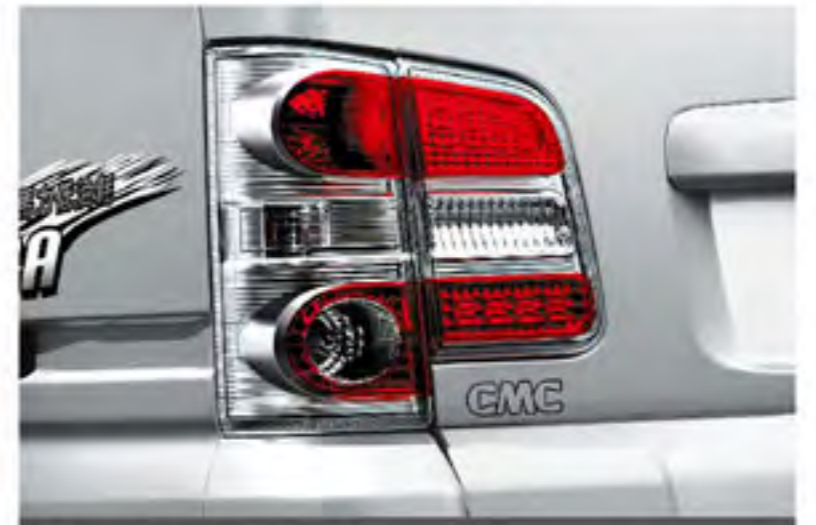
Two-Layer Rear Lamp

The Super Veryca features 1.3L 85 hp MPI engine to enhance fuel economy and deliver the smooth ride.