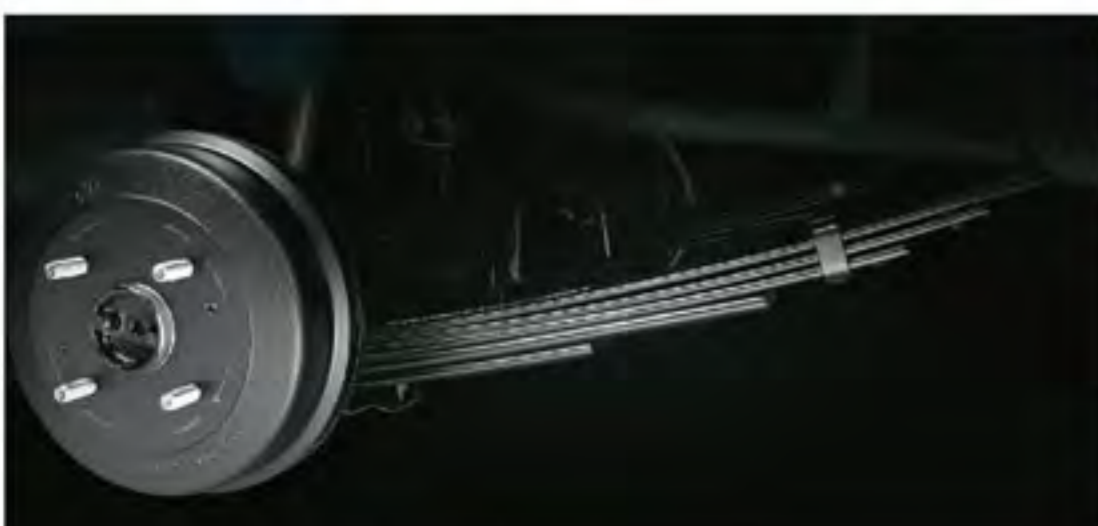
Leaf Spring Rear Suspension