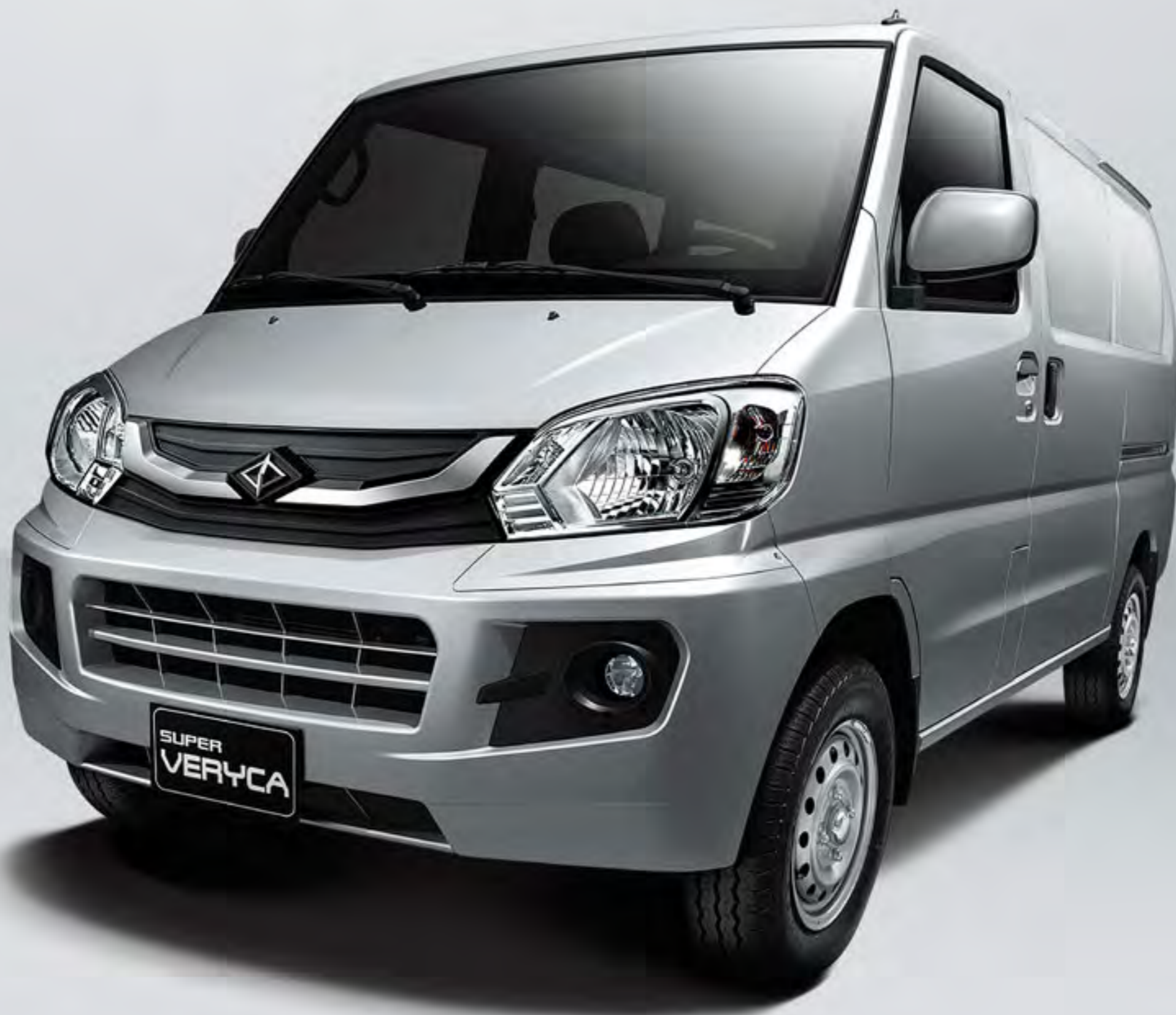
1.3 L 2 Seats Panel

The Super Veryca features 1.3L 85 hp MPI engine to enhance fuel economy and deliver the smooth ride.