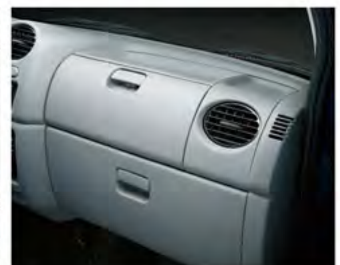
Two-Layer Glove Box