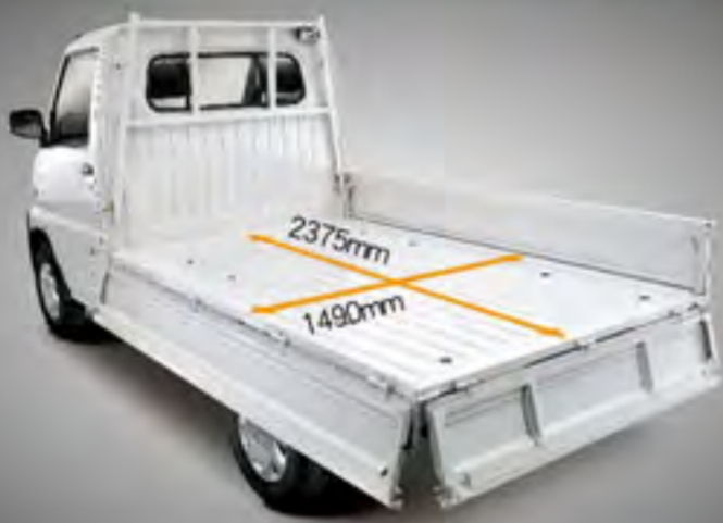
Class-Leading Cargo Area