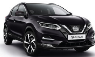
NIGHT SHADE (GAB) <M>