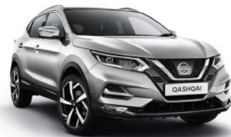
SATIN SILVER (KYO) <M>