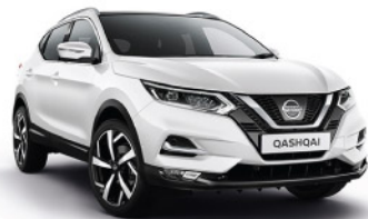
WHITE (326) <S>