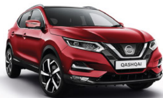
MAGNETIC RED (NAJ) <M>