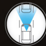
前方碰撞輔助制動系統 (IEB)* INTELLIGENT EMERGENCY BRAKING (IEB)*

Help if you need it. At low speeds, the system warns you if it detects a risk of forward collision with a vehicle.