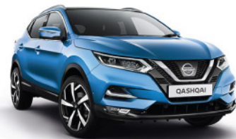
VIVID BLUE (RCA) <M>