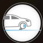
主動式乘坐穩定系統 (IRC) INTELLIGENT RIDE CONTROL (IRC)

Making it easier for you to drive in a congested city. With Intelligent Emergency Braking (IEB), your Nissan QASHQAI is able to detect the car in front and analyze the distance between you and the car ahead, then signal an instant alert and apply light, automatic braking, so you can avoid a possible collision.