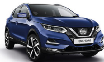
INK BLUE (RBN) <M>