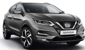
GREY (KAD) <M>