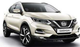
PEARL WHITE (QAB) <M>