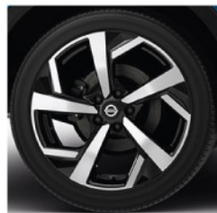
19吋合金輪圈 19" ALLOY