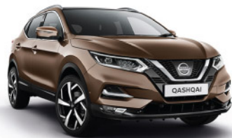
PREMIUM BROWN (CAN) <M>