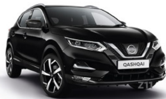
PEARLESCENT BLACK (Z11) <M>