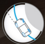
主動式軌跡控制系統 (ITC) INTELLIGENT TRACE CONTROL (ITC)

Take the rough with the smooth. This system applies subtle braking to prevent disturbance when encountering bumps and ensures a comfortably smooth ride.