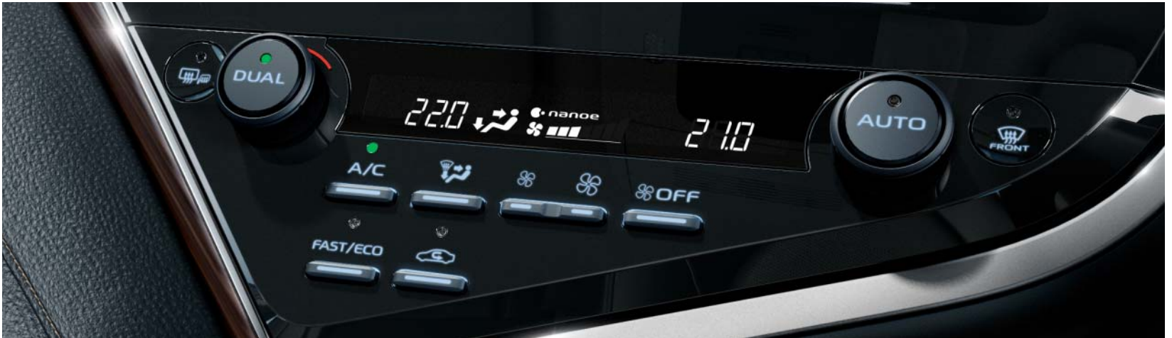
A nanoe™ ion generator cleans the air inside the car, deodorising and suppressing bacteria.