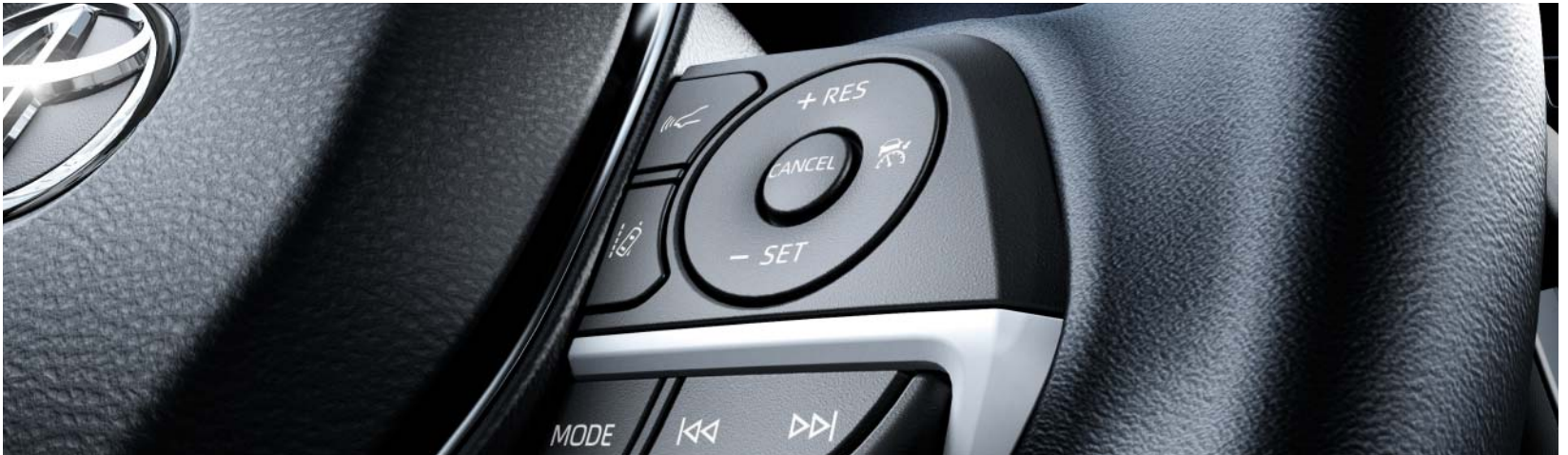
With Cruise Control switches on the steering wheel you don't need to release your hands to change settings.