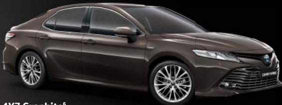
4X7 Graphite §