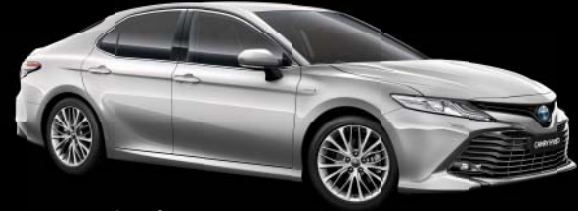
1F7 Tyrol Silver §