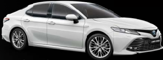
089 Platinum White Pearl *