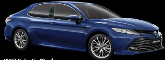
8W7 Galactic Blue §