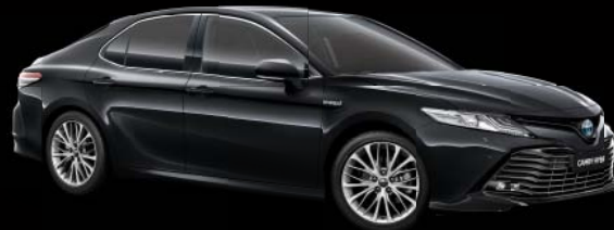
218 Galaxy Black §