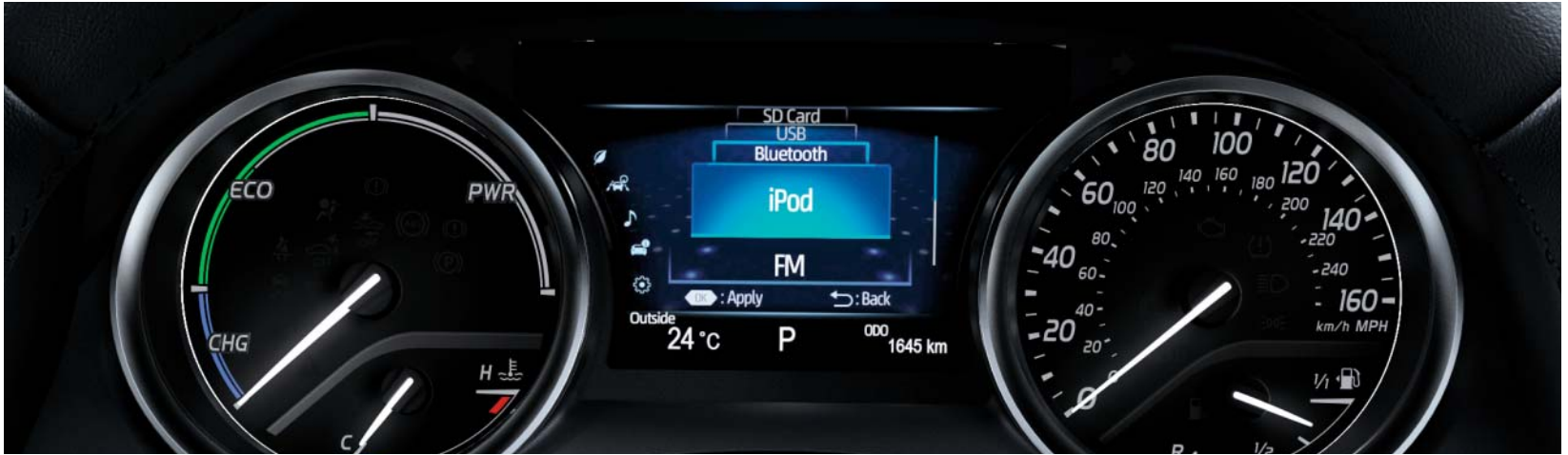
The 7" TFT screen between the dials gives you all the driving information you need.