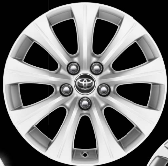
17" alloy wheels (9-spoke) Standard on Design