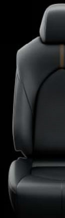
Black leather Standard on Design and Excel