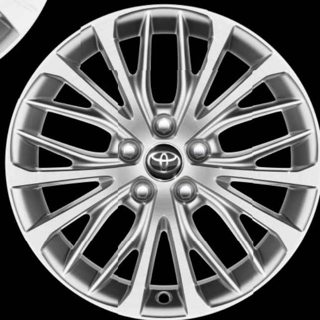
18" alloy wheels (20-spoke) Standard on Excel