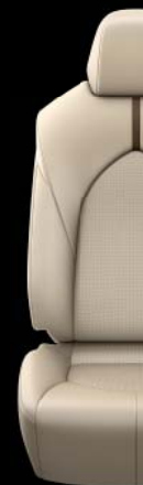
Beige leather Optional on Design and Excel