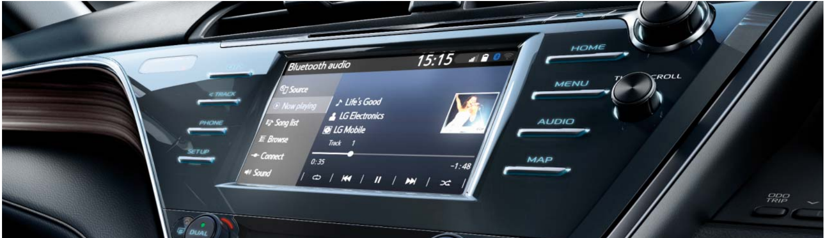
An 8" touch screen gives you access to music, navigation and more.