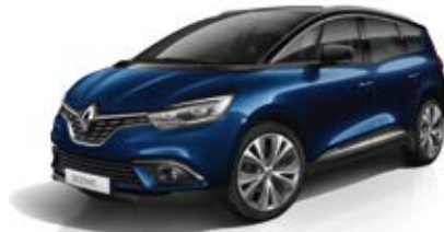
Cosmos Blue 2 with Diamond Black roof XUL