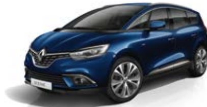
Cosmos Blue 2 RPR