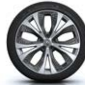
20" Exception alloy wheels