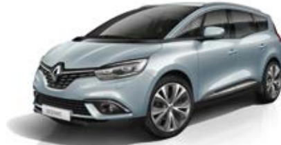
Sky Blue 2 RPQ