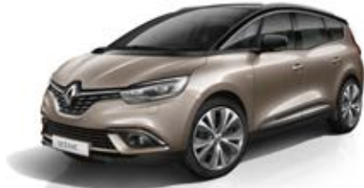
Dune 2 with Diamond Black roof XUJ