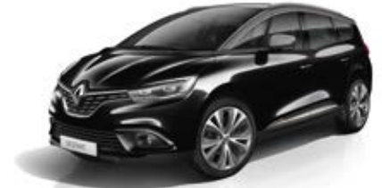
Diamond Black 2 with Oyster Grey roof XUP