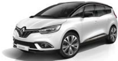
Arctic White 3 with Diamond Black roof XUI