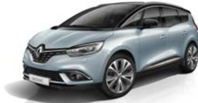
Sky Blue 2 with Diamond Black roof XUK