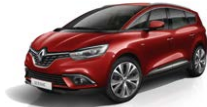
Carmin Red 2 NPF