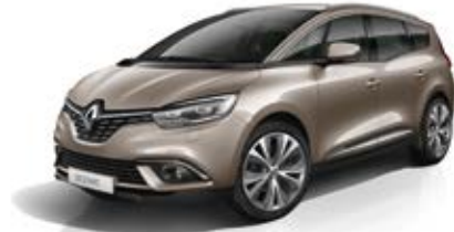
Dune 2 HNP