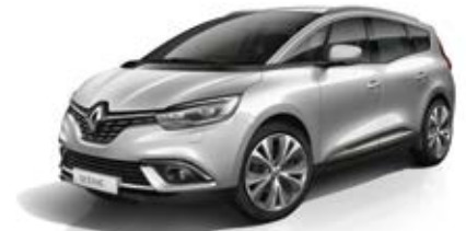
Mercury 2 D69