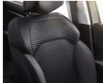
Dark Carbon cloth upholstery