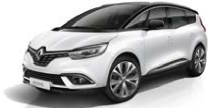
Glacier White 1 with Diamond Black roof XUF