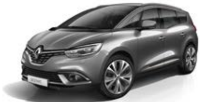
Oyster Grey 2 KNG