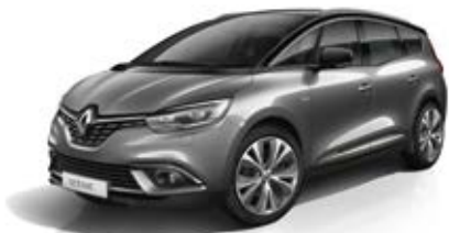
Oyster Grey 2 with Diamond Black roof XNK