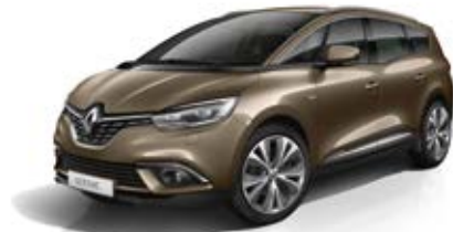
Mink Brown 2 CNM