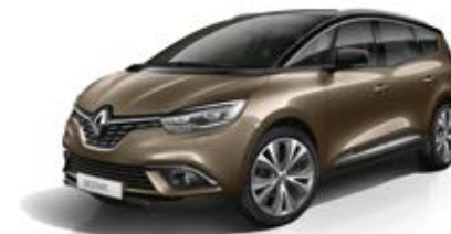
Mink Brown 2 with Diamond Black roof XVR