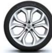
20" Silverstone alloy wheels