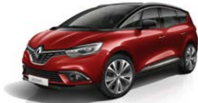
Carmin Red 2 with Diamond Black roof XUM