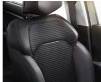
Synthetic leather and Dark Carbon cloth upholstery