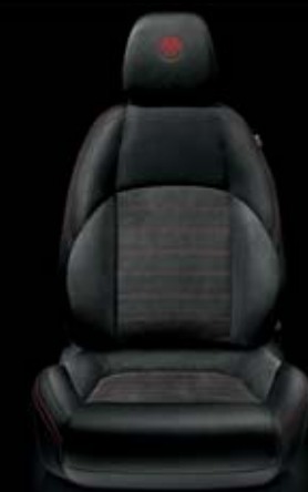
Fabric and Alcantara® 308 Black-Light Grey (standard)