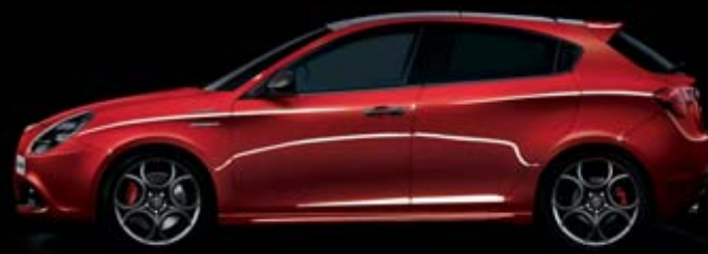
361 Competizione Red