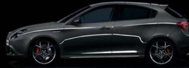
409 Lipari Grey