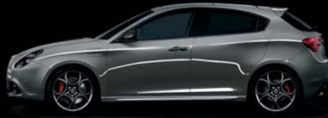
318 Stromboli Grey