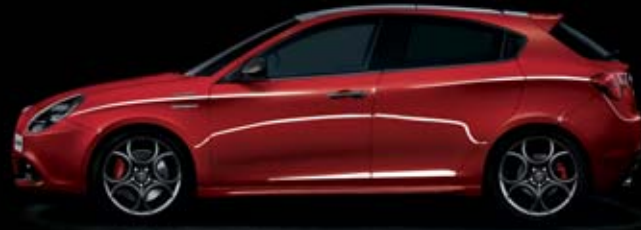
414 Alfa Red