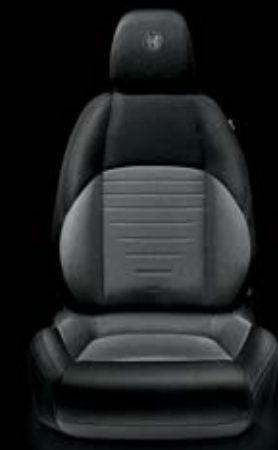
Two-colour fabric 198 Black-Light Grey (standard)