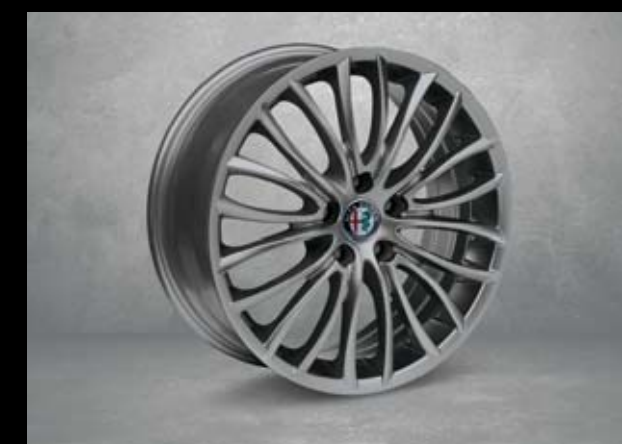
73Z 18" burnished alloy rims spoke with 225/45* tyres