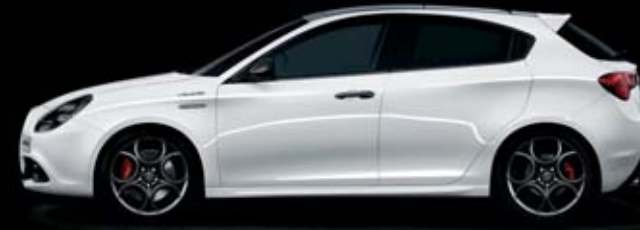
217 Alfa White