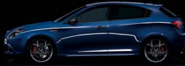
486 Anodizzato Blue