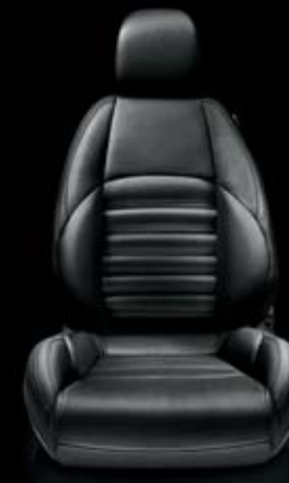
Leather 923 Black (opt)