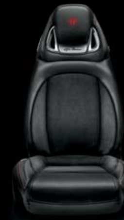
Leather and Alcantara® 323 Black (standard)