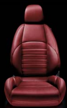
Leather 901 Red (opt)