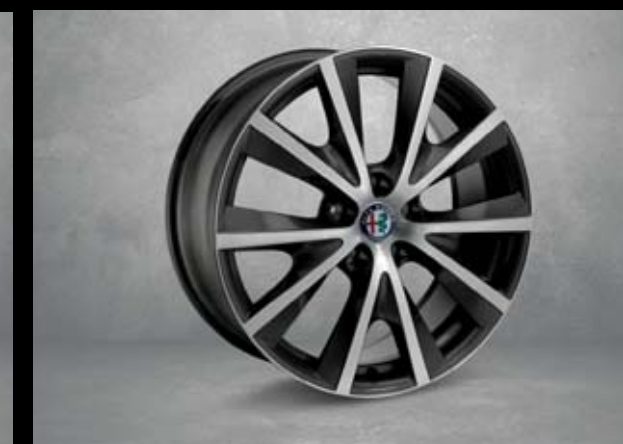
7HP 18" spoke chrome/burnished alloy rims with 225/40 tyres

Standard ● Optional ○ Not available - Linked to Pack P