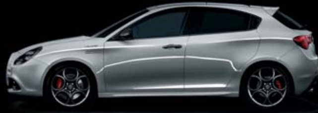
620 Silverstone Grey