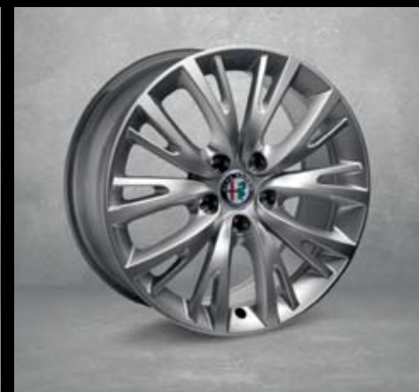
74B 17" spoke alloy rims with 225/45 tyres