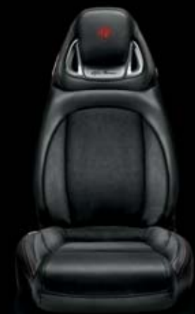
Leather and Alcantara® 323 Black (opt)