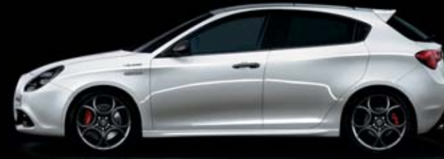
764 Perla Moonlight