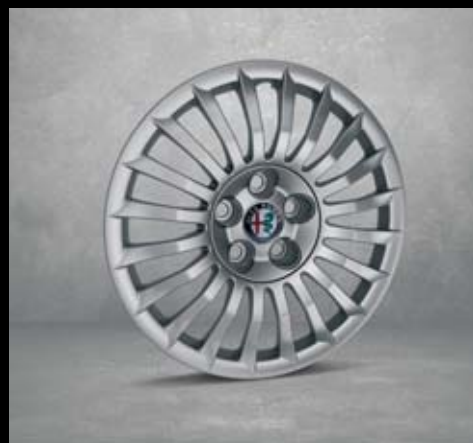
404 16" steel rims with 205/55 tyres