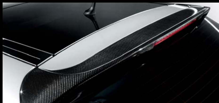
Rear carbon spoiler