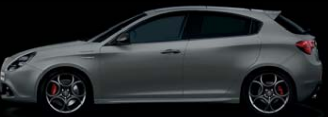
529 Magnesio Grey