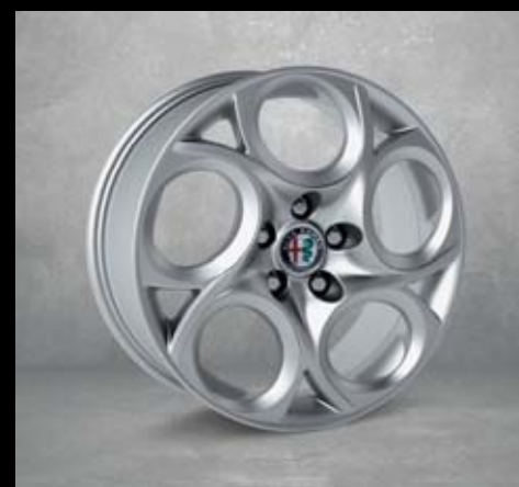
5YN 17" five-hole alloy rims with 225/45 tyres