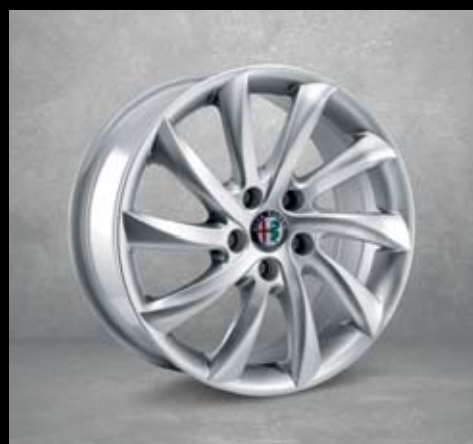
420 17" turbine alloy rims with 225/45 tyres