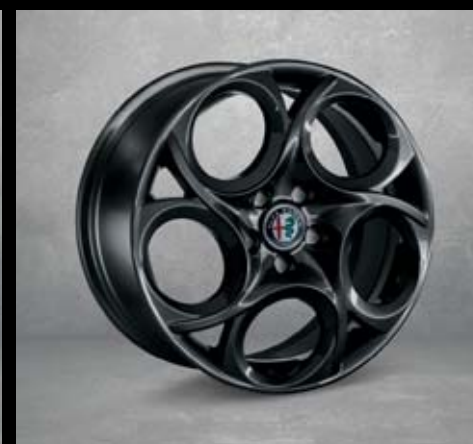
6Y8 17" black alloy rims 5-holes with 225/45* tyres