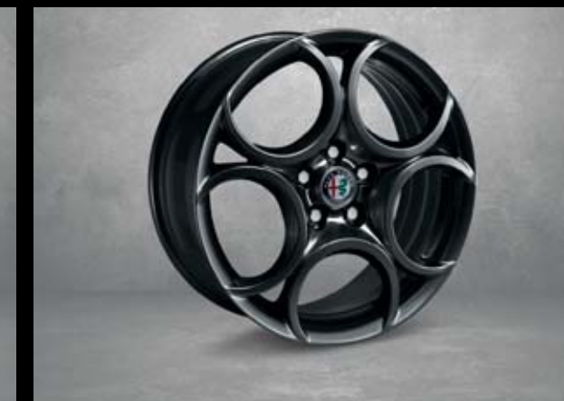
5FB 18" black five-hole alloy rims with 225/40 tyres