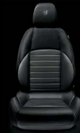
Two-colour fabric 123 Nero-Dark Grey (standard)