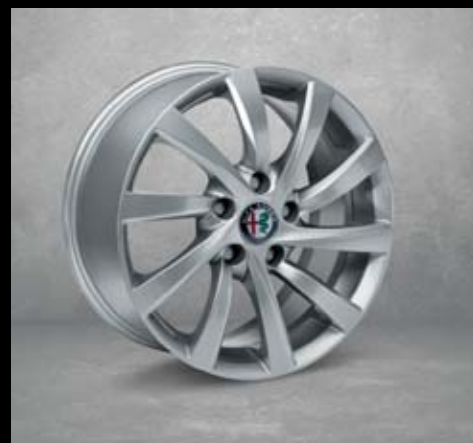
431 16" turbine alloy rims with 205/55 tyres