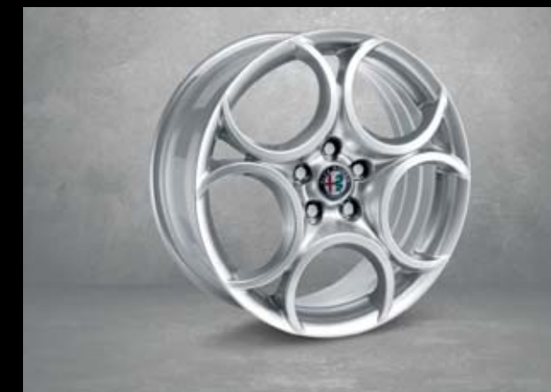
439 18" five-hole alloy rims with 225/40 tyres