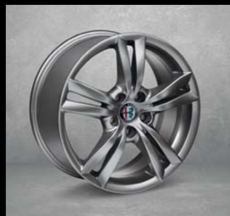
421 17" dual-spoke burnished alloy rims with 225/45 tyres