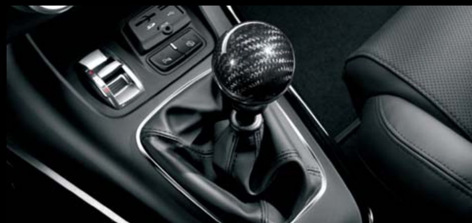
Carbon shift knob