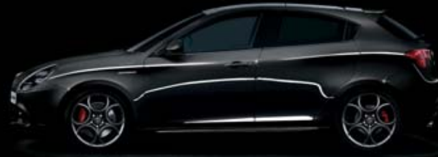
601 Alfa Black