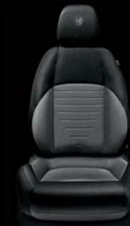
Two-colour fabric 198 Black-Light Grey (standard)