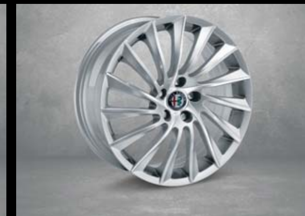
435 18" turbine alloy rims with 225/40 tyres