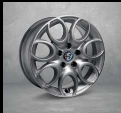
74A 16" seven-hole alloy rims with 205/55 tyres