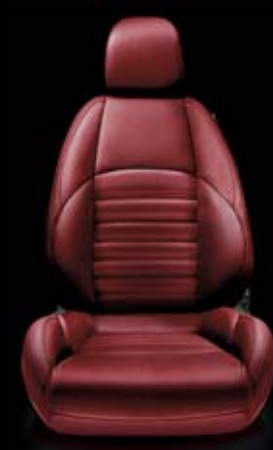
Leather 401 Red (opt)