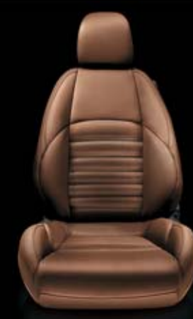
Leather 465 Tobacco (opt)