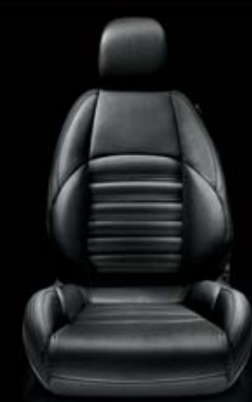
Leather 923 Black (opt)