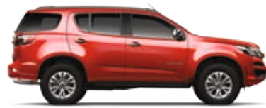
PULL ME OVER RED