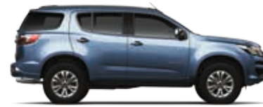
BLUE ME AWAY