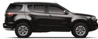
BLACK MEETS KETTLE