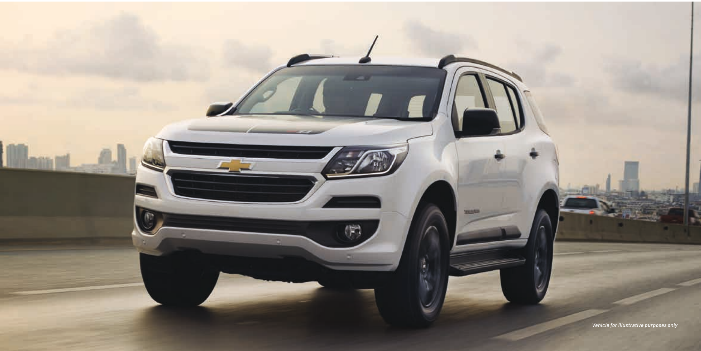
Vehicle for illustrative purposes only