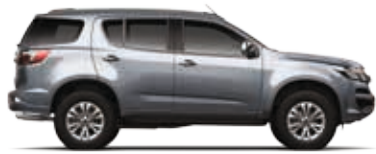
SATIN STEEL GREY