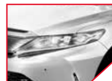
WHITE PEARL CS* (070)