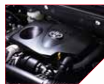
2L TURBOCHARGED ENGINE