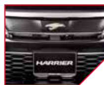
HIDDEN HAWK GRILLE