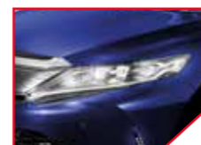
DARK BLUE MICA METALLIC (8W7)