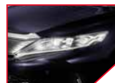
SPARKLING BLACK PEARL CS* (220)