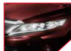
DARK RED MICA METALLIC (3Q3)

Addition of extra features may change figures in this chart. Toyota Motor Corporation and Borneo Motors (Singapore) Pte Ltd reserve the right to alter any details of specifications and equipment without notice.