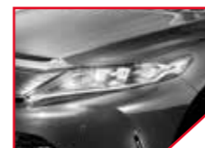
SILVER METALLIC (1F7)