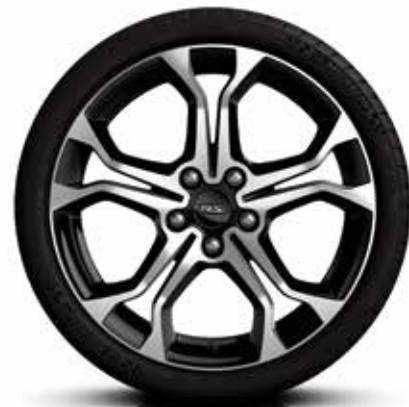
18" Radical diamond-cut alloy wheels with R.S. studs and black inserts (standard)