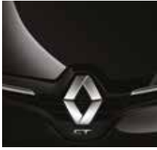
Diamond Black GNE