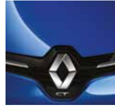
Malta Blue RNT