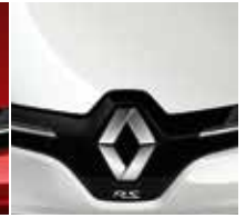
Glacier White 369