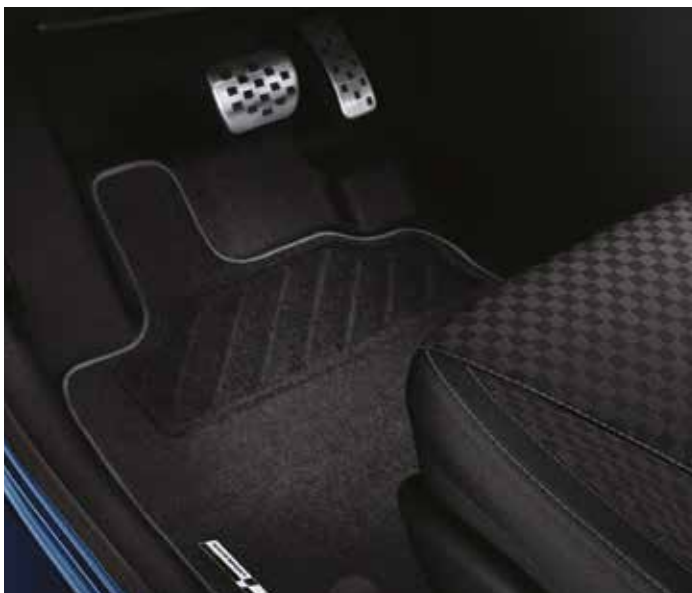
Optional GT carpet mats