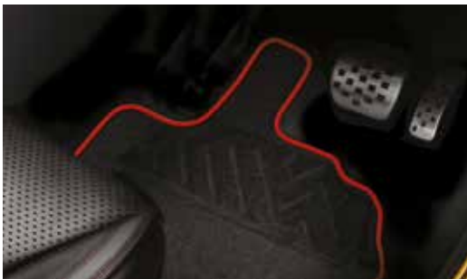
Optional Renaultsport carpet mat