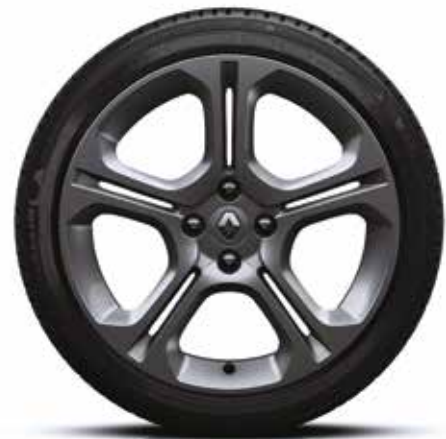
17" GT Anthracite alloy wheels