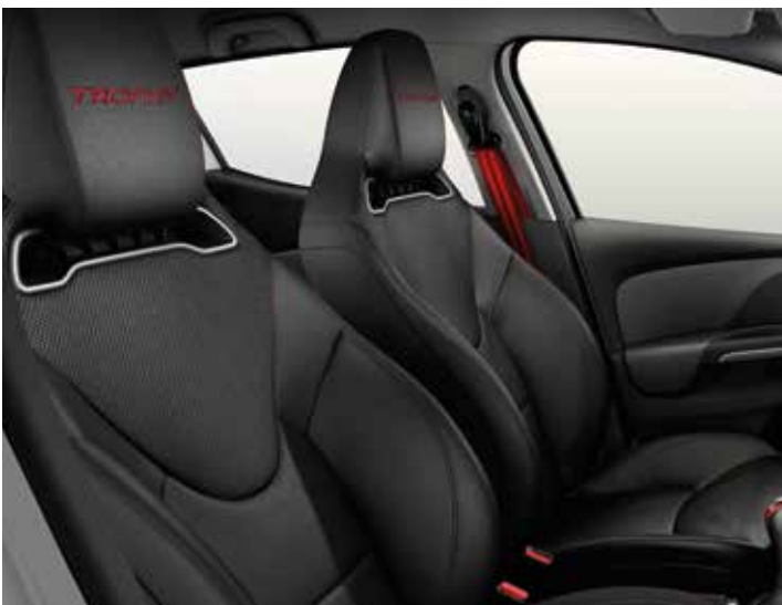
Optional Trophy high-backed front seats with heating elements in Renaultsport dark carbon part leather / part synthetic leather upholstery red replaced by chrome inserts