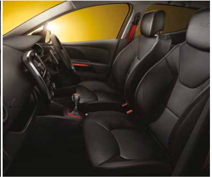
Renaultsport upholstery in dark carbon part leather / part synthetic leather upholstery and R.S. logo on front headrests (optional) with heated front seats