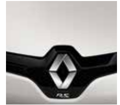
Frost White QNR*