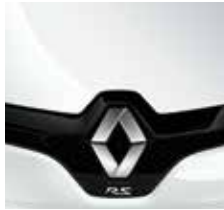
Glacier White 369