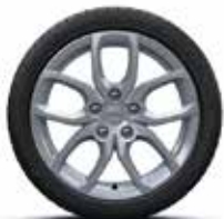
17" Renaultsport Silver alloy wheels