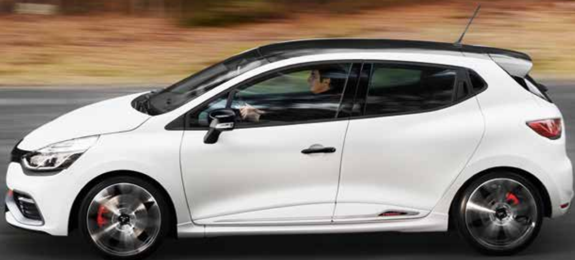
Colour shown is optional Frost White Renault i.d. matt paint with gloss black roof

18" Radical diamond-cut alloy wheels - with R.S.studs and black inserts Anti drill lock doors and locking fuel cap Daytime Running Lights Door mirrors - electrically adjustable and folding, heated-body coloured (or black gloss with liquid yellow and frost white paint) Extra tinted windows - rear and tailgate F1-style front blade - anthracite with TROPHY branding Indicators with lane change function Rear diffuser with twin chrome rectangular exhaust Renaultsport rear spoiler - body coloured R.S. logo under front diamond Side door insert, boot lid insert and front grille inserts - silver TROPHY branding on side door moulding