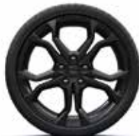
18" Renaultsport Black Gloss alloy wheels