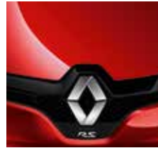
Flame Red NNP