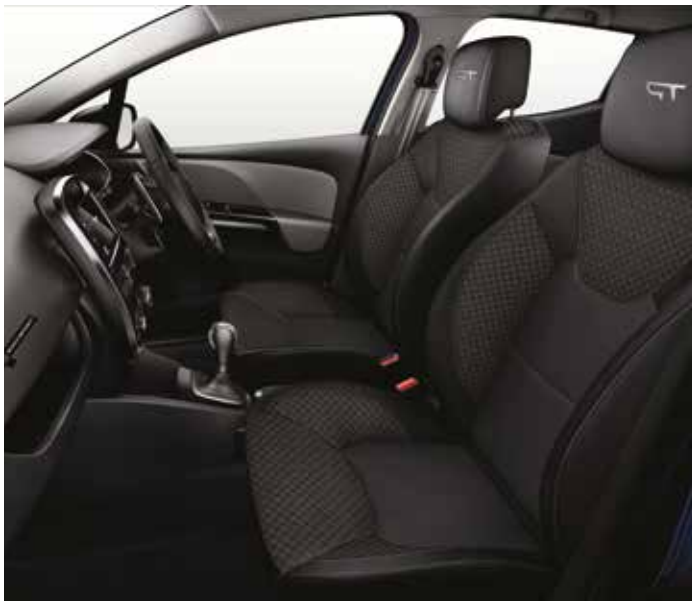
GT upholstery in dark carbon cloth and GT logo on front headrests