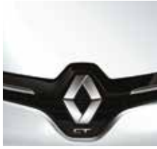
Glacier White 369