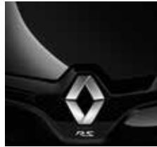
Deep Black GNA