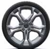
18" Renaultsport Anthracite alloy wheels