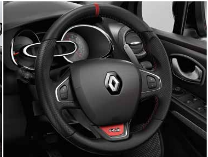
R.S. steering wheel