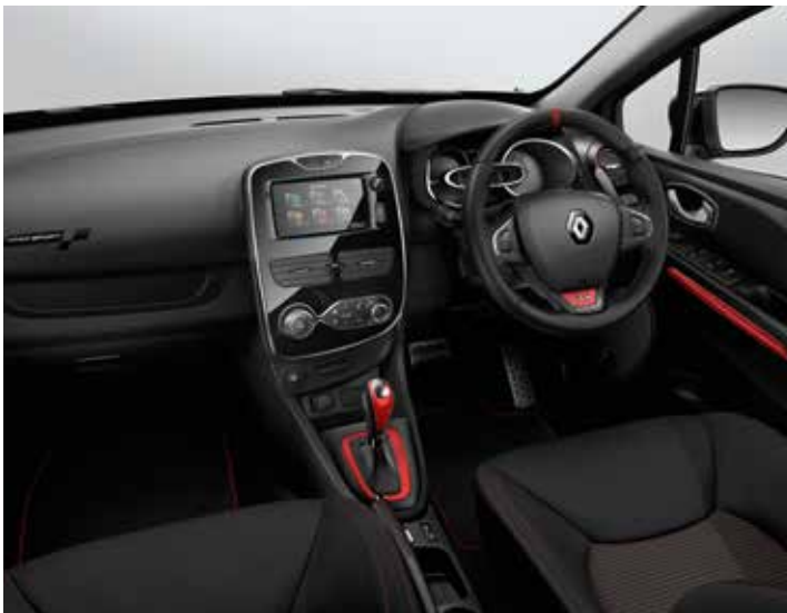
Renaultsport upholstery in dark carbon cloth with red stitching and R.S. logo on front headrests (standard)