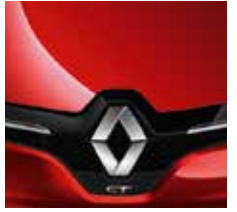
Flame Red NNP