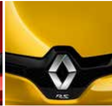
Liquid Yellow J37