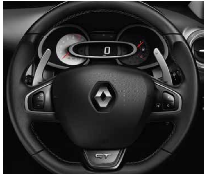
Leather steering wheel with GT logo insert and paddle shift controls