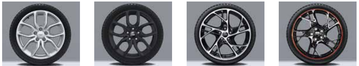
18" TIBOR satin anthracite alloy wheels