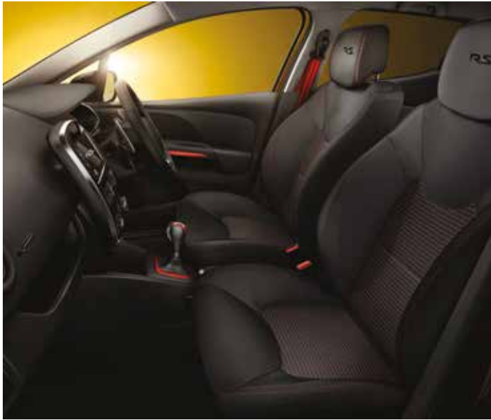
Renaultsport upholstery in dark carbon cloth with red stitching and R.S. logo on front headrests (standard)