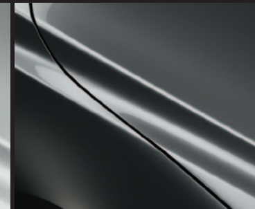
Meteor Grey Mica*

* Metallic and Mica paint is available at no additional cost.