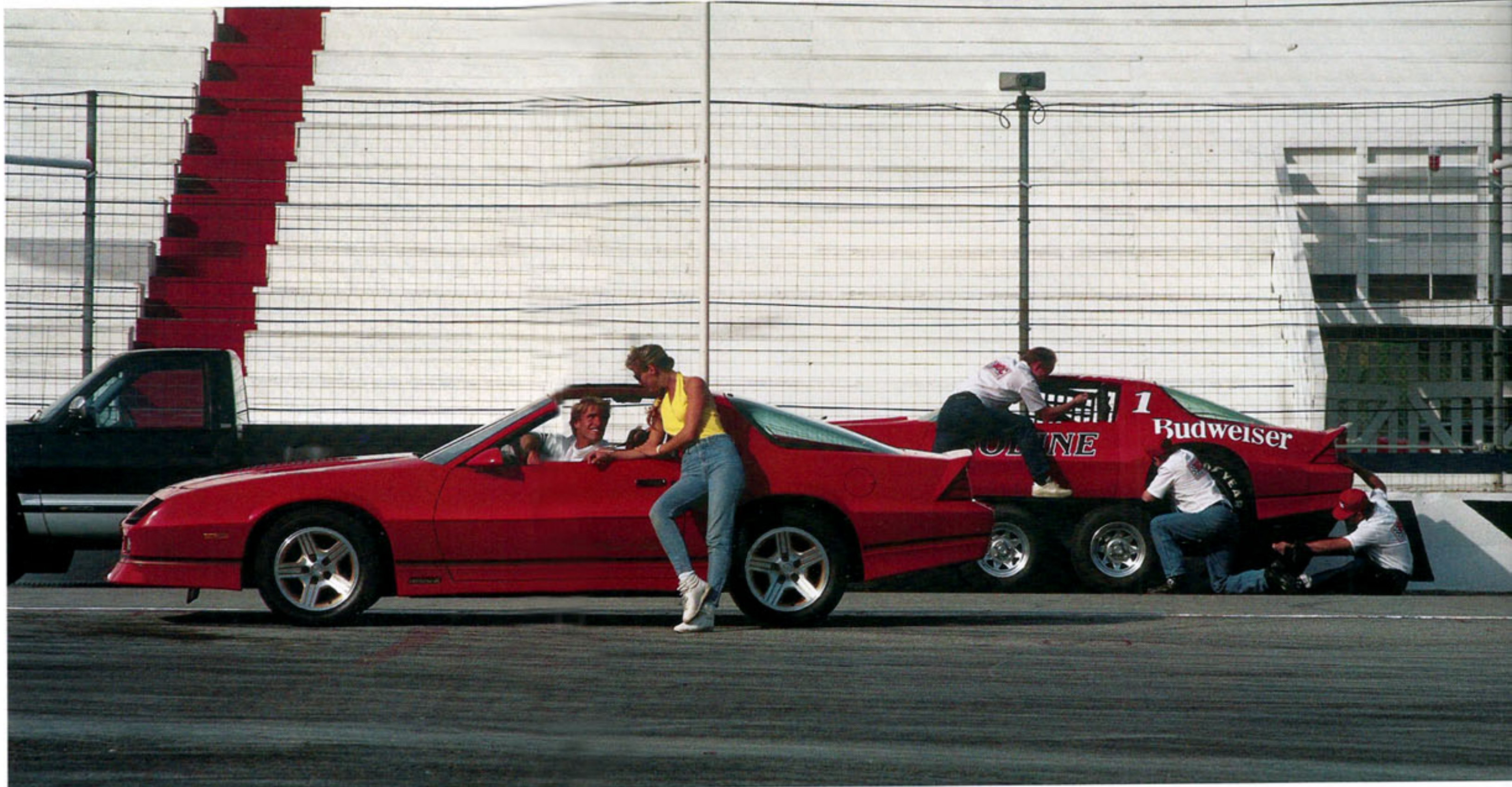
Camaro IROC-Z Coupe with optional removable roof panels and 16" cast-aluminum wheels.

Fast-ratio power steering, larger stabilizer bars front and rear, and grippy 15" Eagle GT tires are all part of the competition-proven suspension. For the ultimate in IROC-Z appearance, 16" aluminum wheels and Eagle unidirectional tires are optional.