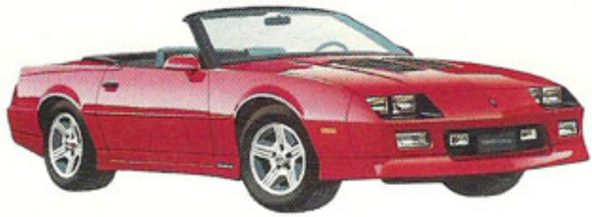
Camaro IROC-Z Convertible.