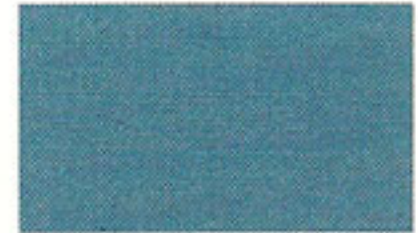
Light Blue Metallic*