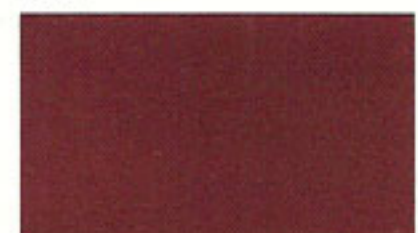
Dark Red Metallic