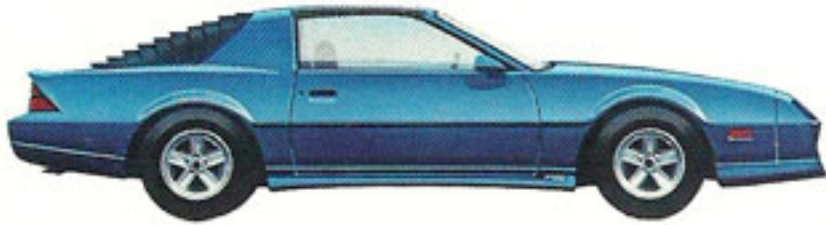
Camaro RS Coupe with optional rear window louvers.