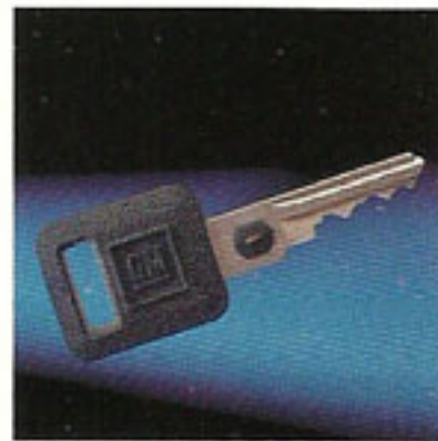
PASS-Key™ theft deterrent system is standard on all 1989 Camaros.