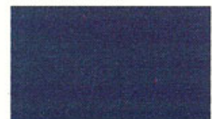
Bright Blue Metallic