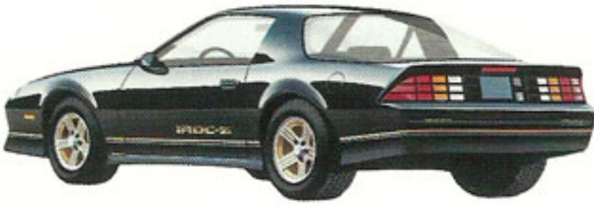
Camaro IROC-Z Coupe.