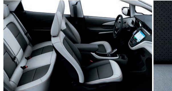
Dark Galvanized Gray/Sky Cool Gray Perforated Leather Appointments 6