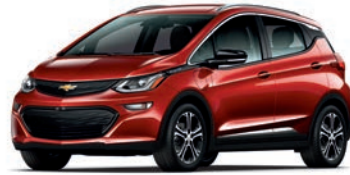
CAJUN RED TINTCOAT 3 (With Black Grille)