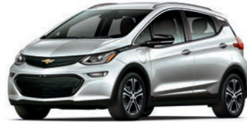
SILVER ICE METALLIC 1,2 (With Black Grille)