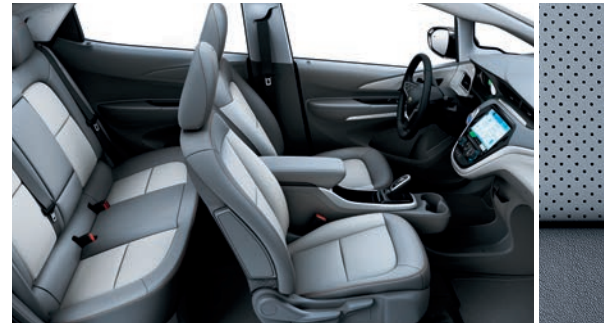
Light Ash Gray/Ceramic White Perforated Leather Appointments 6