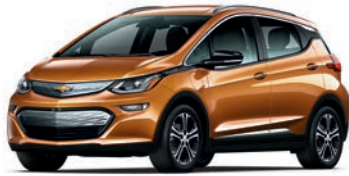
ORANGE BURST METALLIC 3 (With Dark Silver Grille)