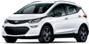
SUMMIT WHITE (With Black Grille)