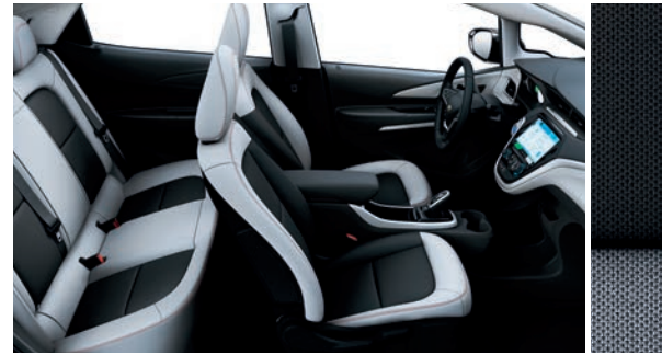
Dark Galvanized Gray/Sky Cool Gray Deluxe Cloth 5