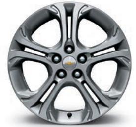
17" Painted-Aluminum (Standard on LT)