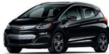
MOSAIC BLACK METALLIC (With Dark Silver Grille)