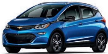
KINETIC BLUE METALLIC 3 (With Black Grille)