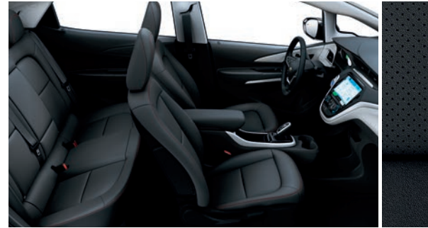
Dark Galvanized Gray Perforated Leather Appointments 6