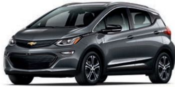
NIGHTFALL GRAY METALLIC (With Black Grille)