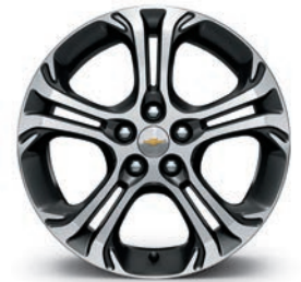
17" Ultra Bright Machined-Aluminum with Painted Pockets (Standard on Premier)