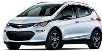
ARCTIC BLUE METALLIC 4 (With Black Grille)