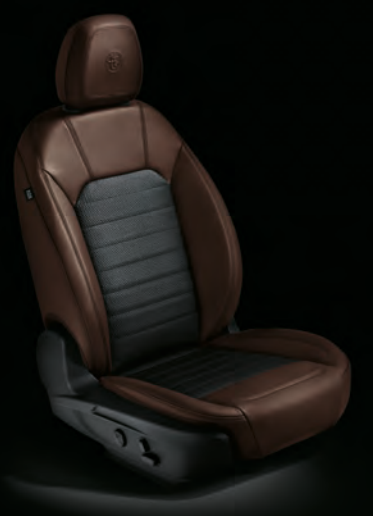
Red leather & cloth upholstery