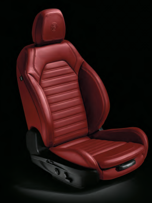
Red leather sports seats