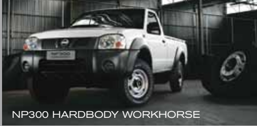
NP300 HARDBODY WORKHORSE