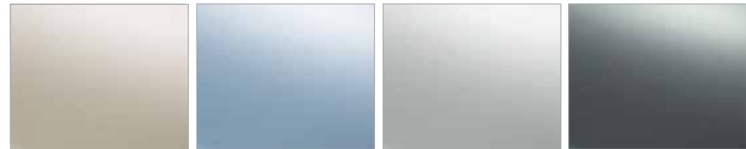
Thermal Gold (M) K32

Choose a colour that perfectly complements every aspect of your character.