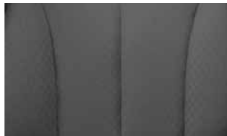
Tricot Cloth Sedan H30

The tasteful, high quality upholstery material covering the comfortable seats is a treat, both to look at and to touch.