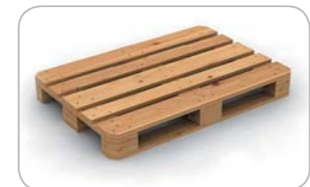
... or 3 europallets