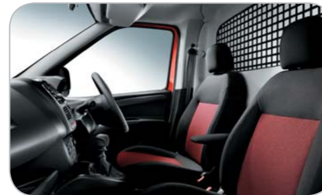
STAR RED 231