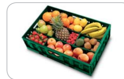
Load up to 33 boxes of fruit...