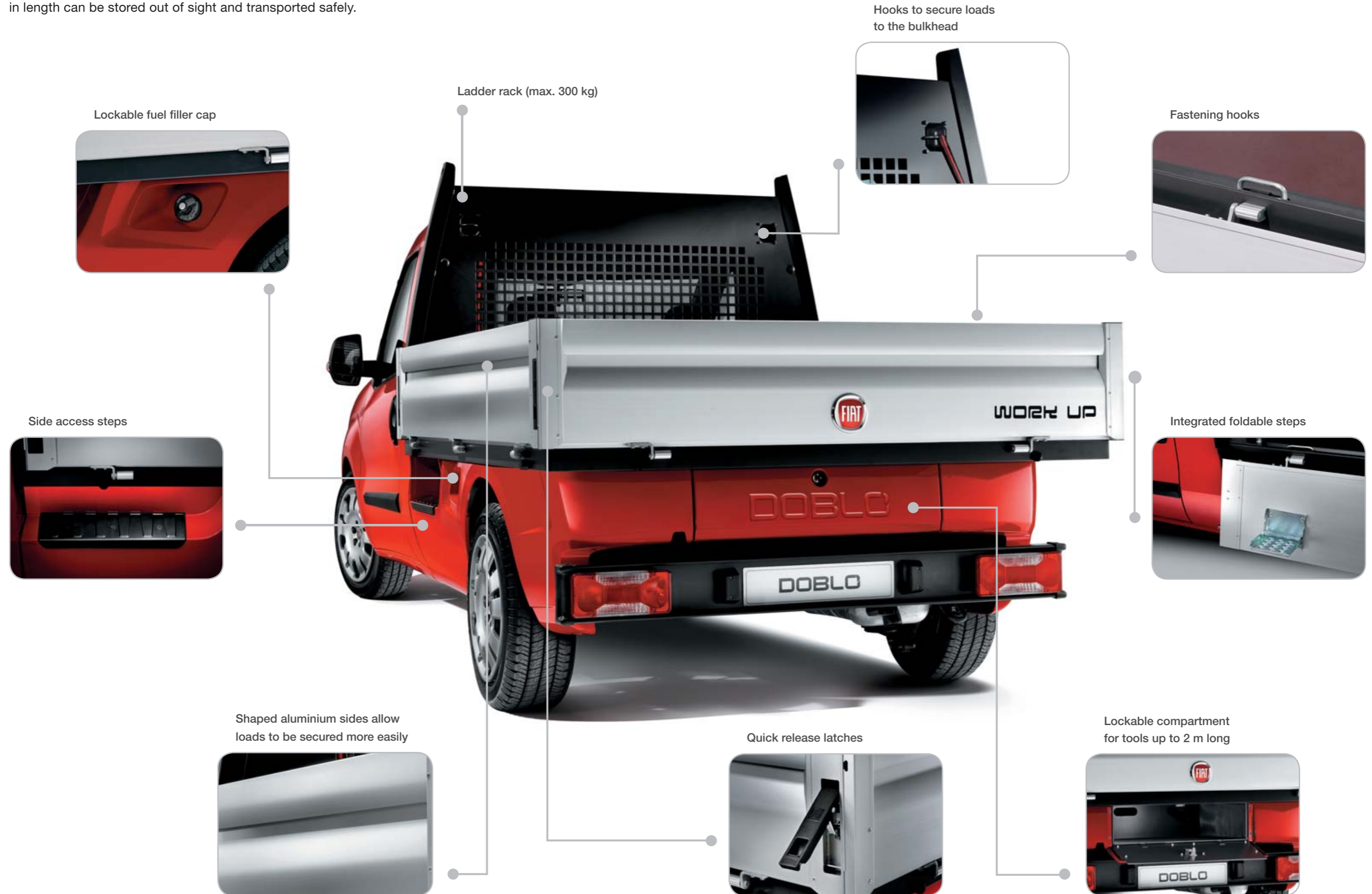
Lockable fuel filler cap

Innovation and attention to detail are hallmarks of Fiat Professional vehicles. The Doblò Work Up features fold out steps to ease access to the load area, shaped aluminium sides allow loads to be secured safely, quick release latches and a lockable compartment means tools up to 2 m in length can be stored out of sight and transported safely.