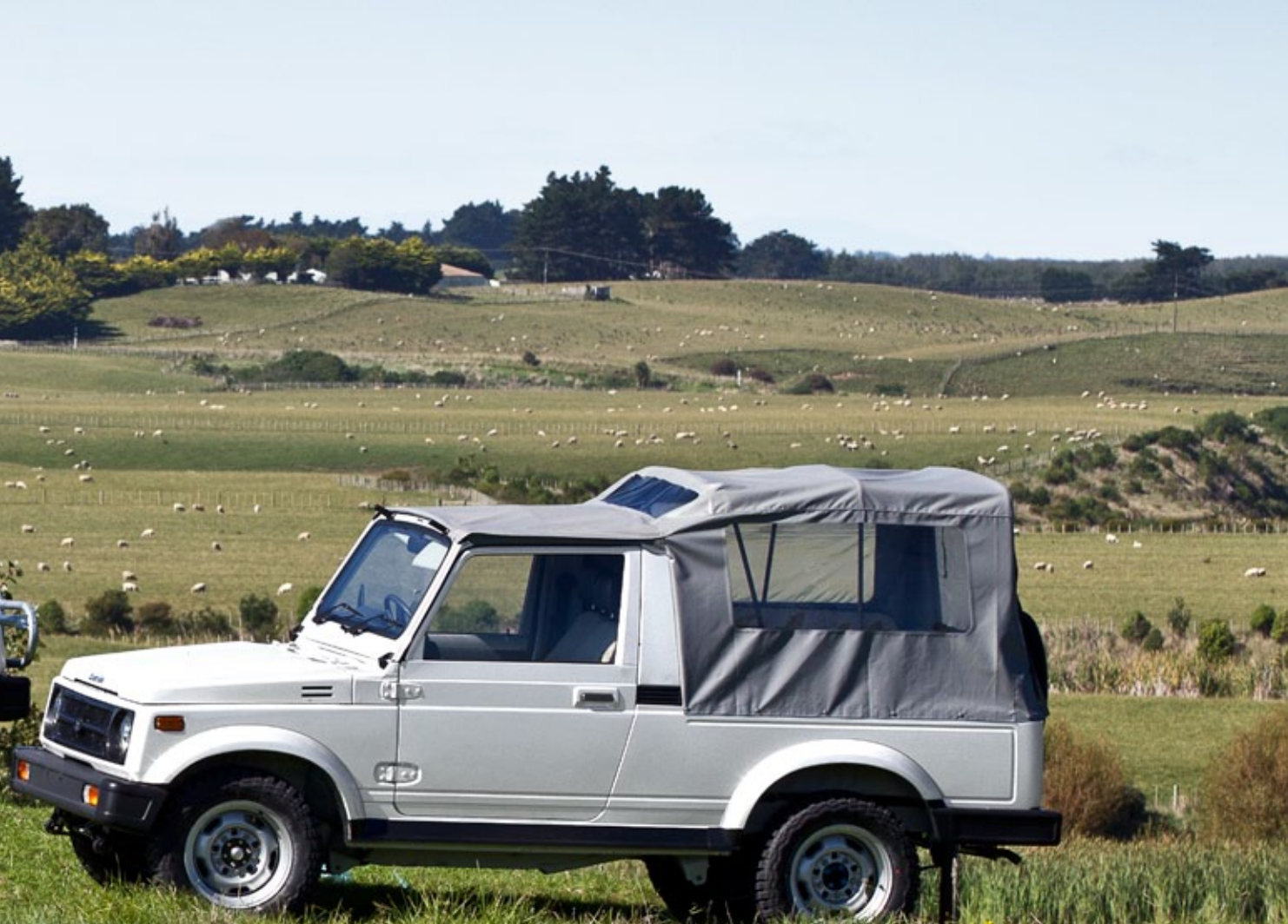
Farm Worker Versatile