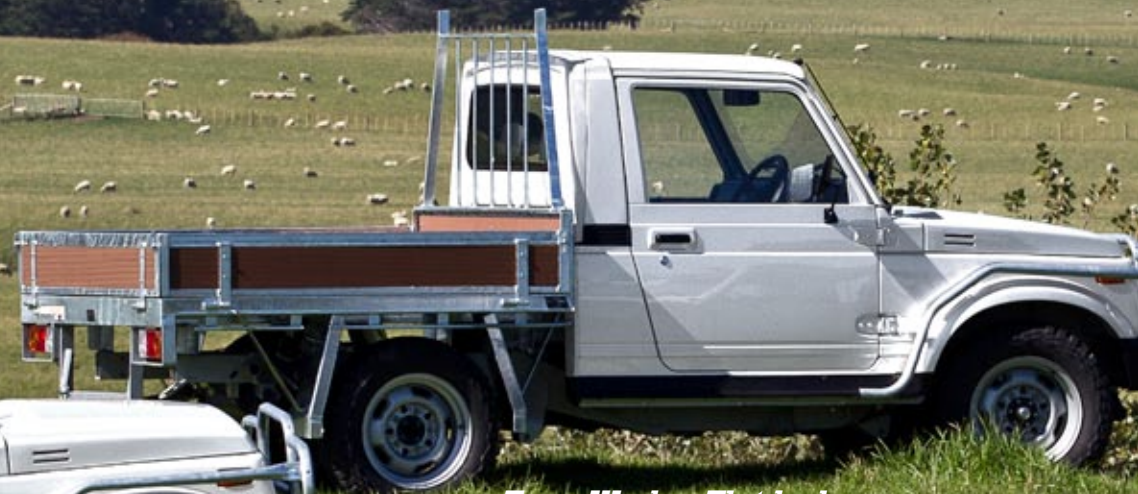
Farm Worker Flatdeck