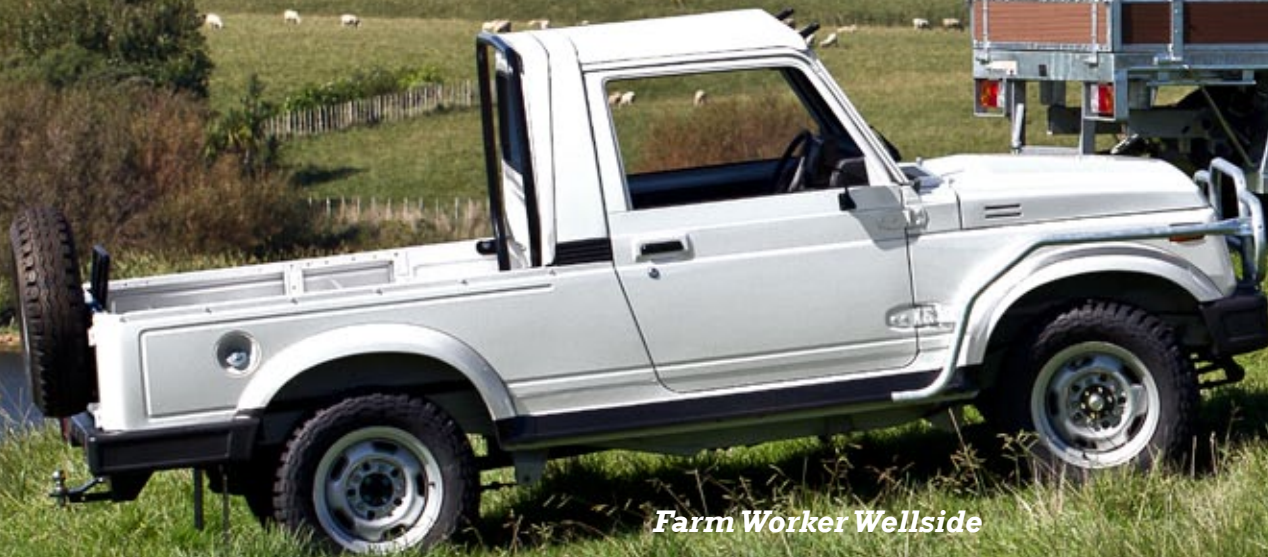
Farm Worker Wellside