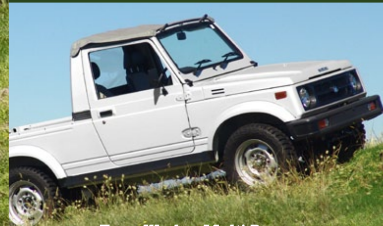
Farm Worker Multi Purpose

If you are looking for versatility, comfort, and rugged reliability, the Suzuki Farm Worker 4x4 could be just what you need.