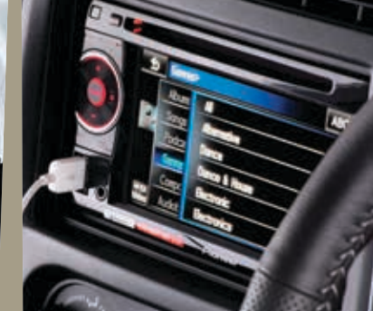
PIONEER® MULTIMEDIA UNIT