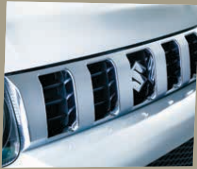
CHROMED FRONT GRILLE TRIM