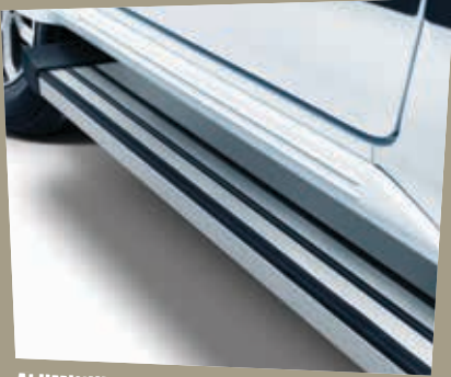
ALUMINIUM RUNNING BOARD