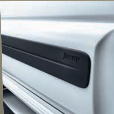
SIDE MOULDING SET