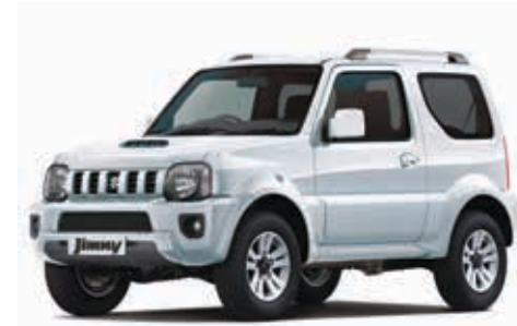
PEARL WHITE METALLIC*

*Available on SZ3 models †Available on SZ4 models