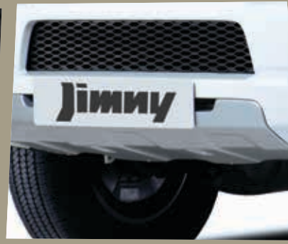
FRONT SKID PLATE