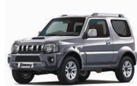
QUASAR GREY METALLIC*