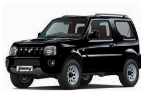
BLUEISH BLACK PEARL METALLIC*