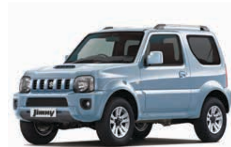
BREEZE BLUE METALLIC*