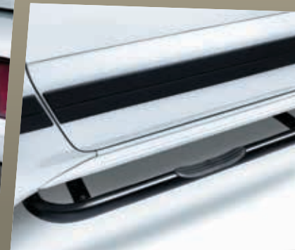
SIDE SPORT BAR SET (BLACK)