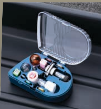
SPARE BULB AND FUSE SET