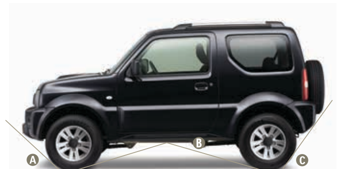
A 34° approach angle (default setting, unloaded Jimny) B 31° ramp breakover angle C 46° departure angle

All year round, the Jimny is a 4x4 designed for adventure. Every time you climb aboard, there's one waiting to happen.