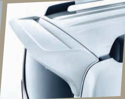
REAR UPPER SPOILER