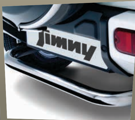
CHROMED REAR SPORT BAR