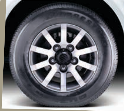
'DAKAR' ALLOY WHEEL