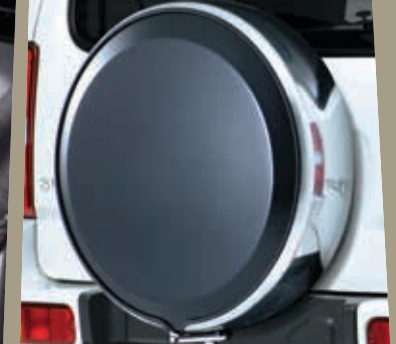
HARD SPARE WHEEL COVER