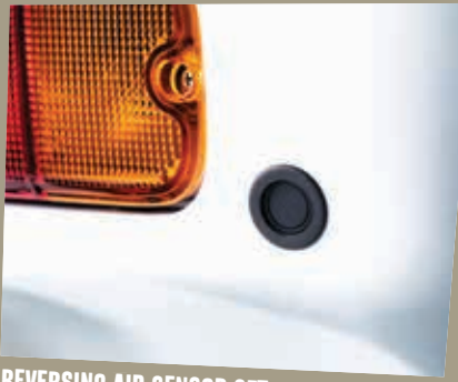
REVERSING AID SENSOR SET