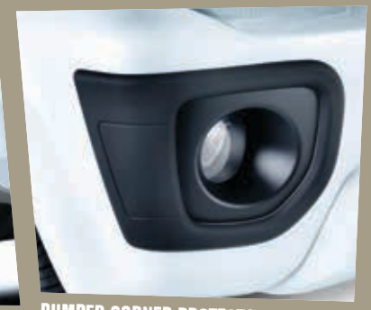
BUMPER CORNER PROTECTOR SET