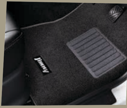
CARPET MAT SET