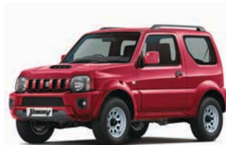
PHOENIX RED PEARL METALLIC*