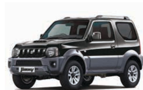
BLUEISH BLACK PEARL/QUASAR GREY 2-TONE*