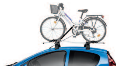
▶ Cycle carrier on roof bars