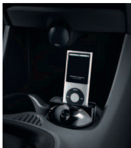
▶ iPod Connector