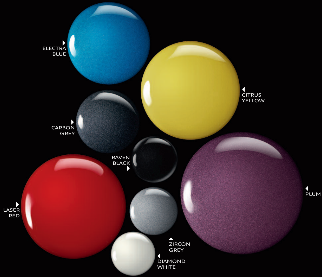
▶ ELECTRA BLUE