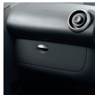
▶ Glovebox cover