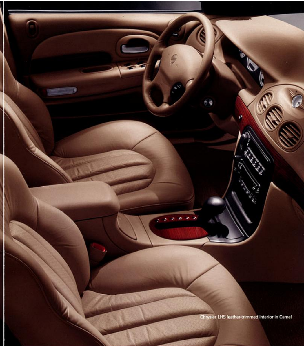
Chrysler LHS leather-trimmed interior in Camel