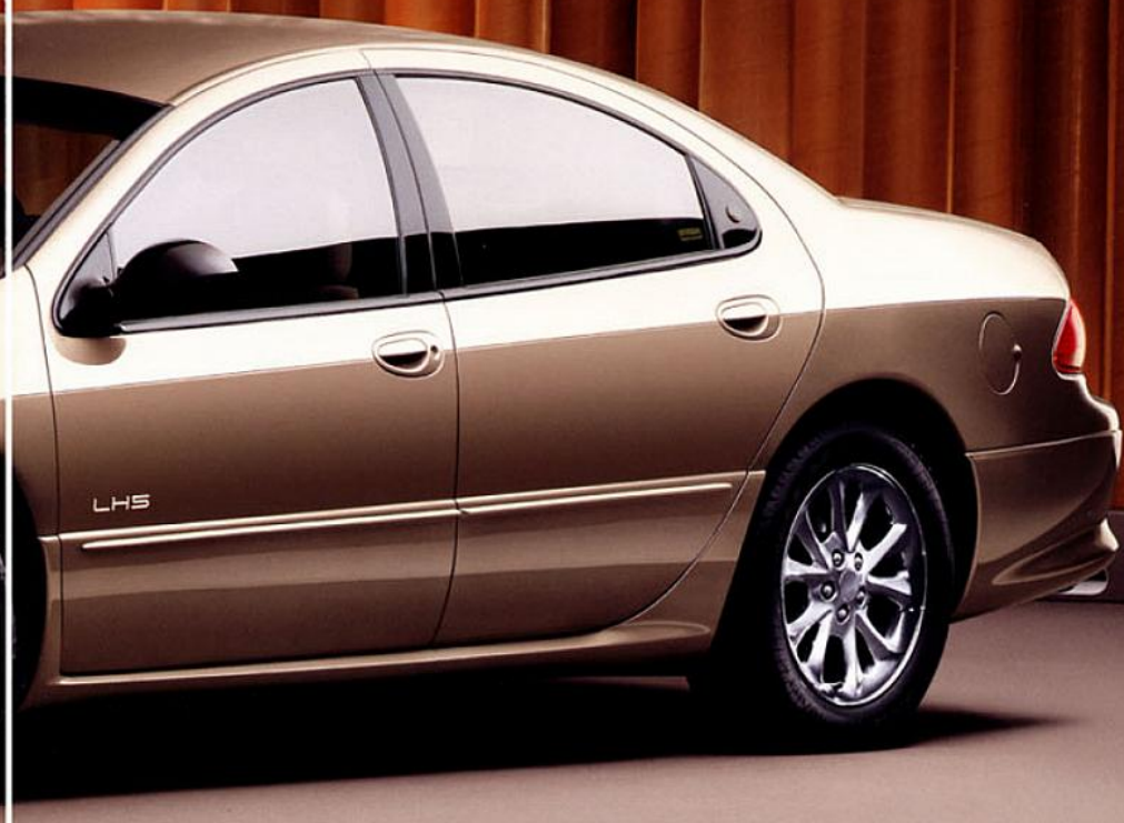
Chrysler LHS in Champagne Pearl Metallic

Since the time of printing, some of the information you'll find in this catalog may have been updated. Ask your dealer for details. Some of the equipment shown or described throughout this catalog is available at extra cost.