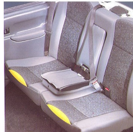
Wide rear passenger seat with integral child seat

It all adds up to a better drive in a taxi designed for the comfort and safety of both you and your passengers.