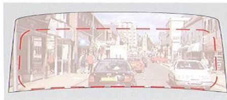
48% bigger screen for better visibility

The TX1 also helps to protect you in other ways too. There's a security screen between you and your passengers. You have central control of the locks on all doors. And a door mounted switch can be used to lock the front doors only.