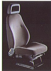
Ergonomic purpose-designed driver's seat

You'll be at the wheel for a long time. So, the adjustable driving seat in the TX1 is based on the same advanced seat technology that