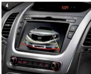
Image shows the reversing camera system 7" Touchscreen ('KX-2 Sat Nav' models upwards)