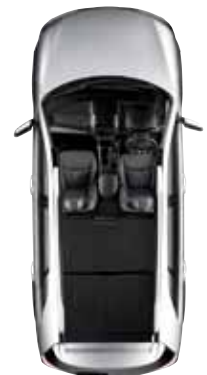
2 nd & 3 rd row folding