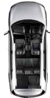
Partial 3 rd row folding

The spacious and flexible interior of the Sorento is a rare blend of functionality, luxury and style made possible by partial or full-row seat folding including 60:40 split-folding second row seats and 50:50 split folding third row seats to provide comfort for all passengers but also the convenience and practicality of transporting bulky items.