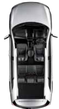
3 rd row folding