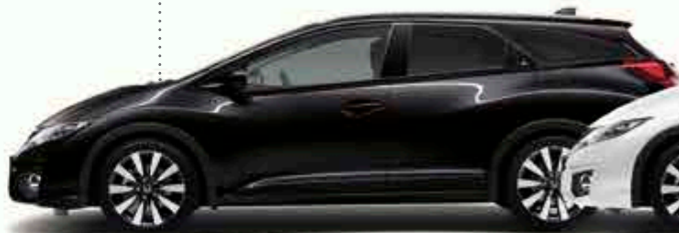
Crystal Black Pearl