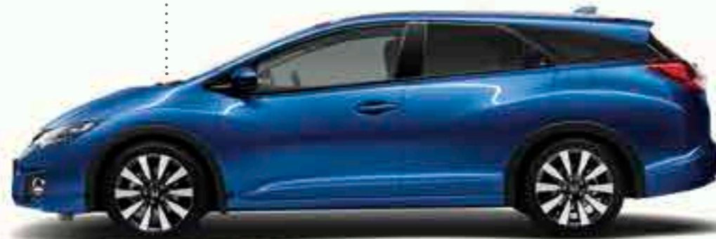
Brilliant Sporty Blue Metallic