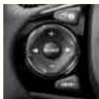
AUDIO STEERING WHEEL CONTROLS

Images are shown for illustration purposes only and show a left hand drive vehicle. In the UK, the Civic Tourer will be a right hand drive vehicle.