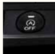
IDLE STOP BUTTON (manual transmission only)