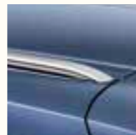
SILVER ROOF RAILS