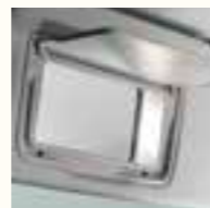
SUNVISOR VANITY MIRROR