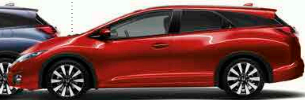
Passion Red Pearl