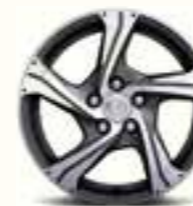
17" & 18" ARGON