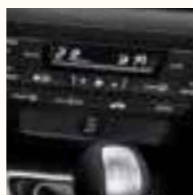
DUAL AIR CONDITIONING