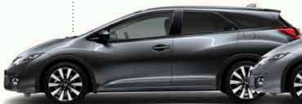
Polished Metal Metallic