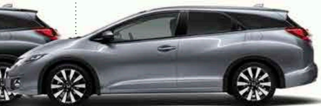
Lunar Silver Metallic