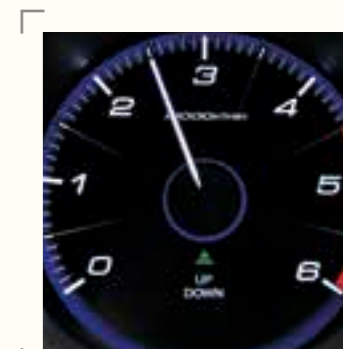
SHIFT INDICATOR LIGHT