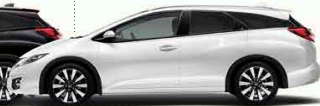
White Orchid Pearl