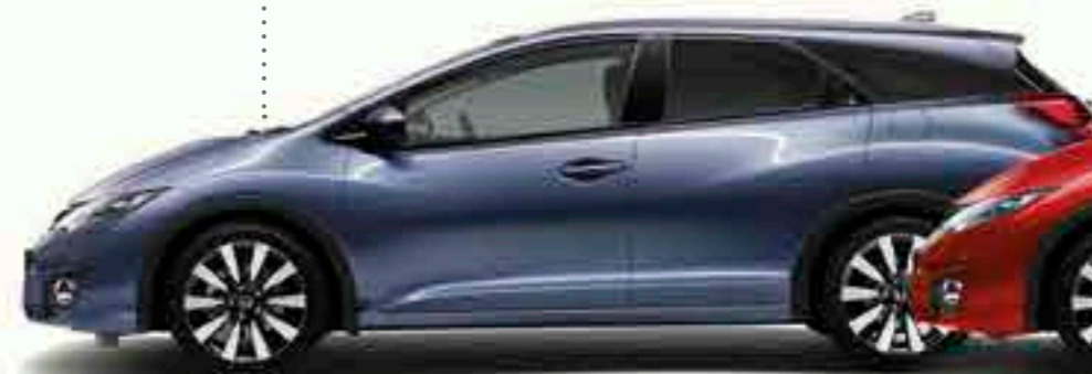
Twilight Blue Metallic